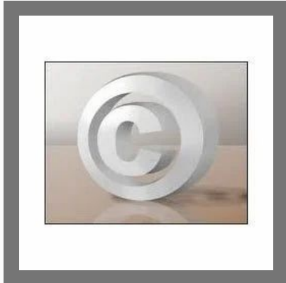
Copyright Registration Services