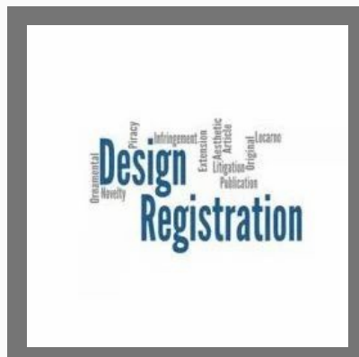
Design Registration Services