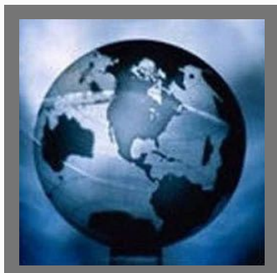
L. L. P. Registration Services