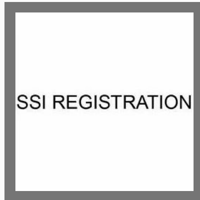
S. S. I. Registration Services