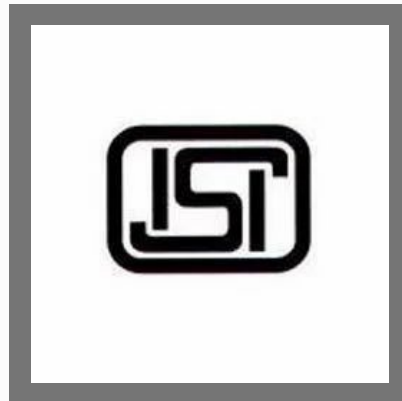
I. S. I. Registration Services