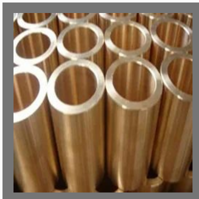
Gun Metal Bushes