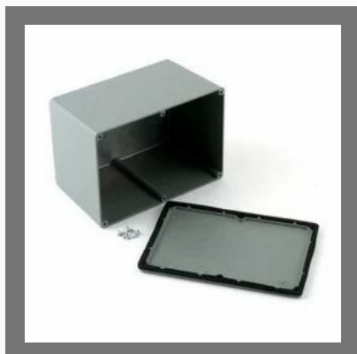
Aluminum Casted Boxes