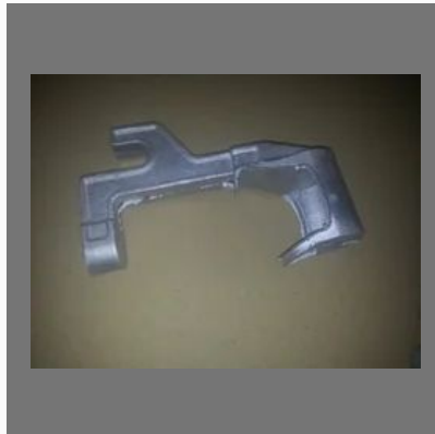
Aluminum Bracket Casting