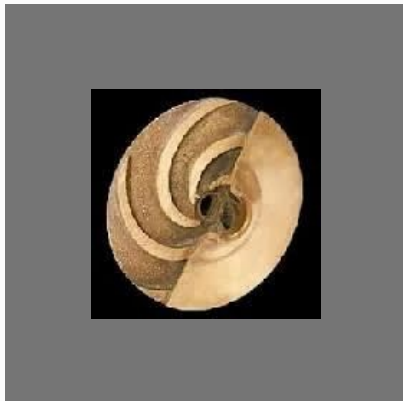
Phosphor Bronze Castings