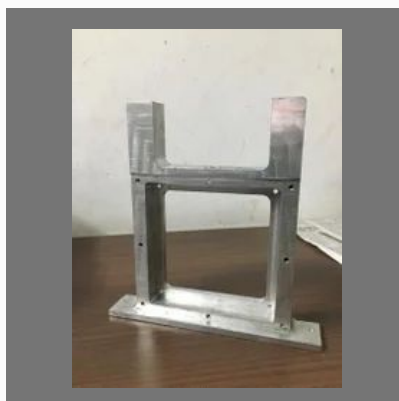
Precision Cnc Components