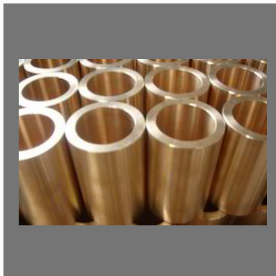
Gun Metal Bushes