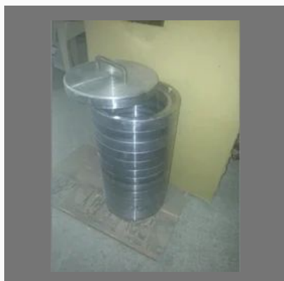
Lead Shielding Casting