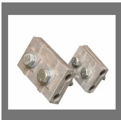
Aluminium Casting Clamps