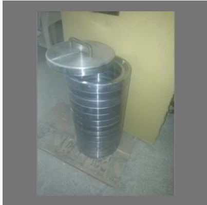
Lead Shielding Casting