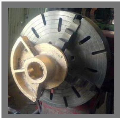
Aluminium Bronze Castings