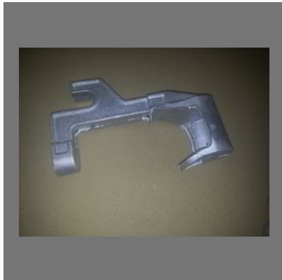
Aluminum Bracket Casting