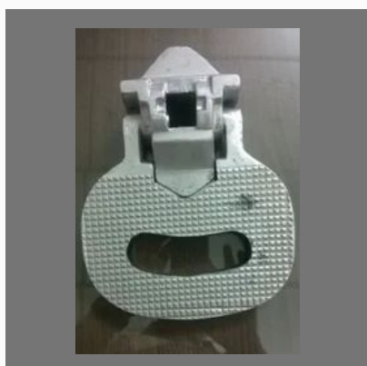
Foot Rest For Defence Shelters