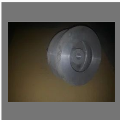
Aluminum Pulley Casting