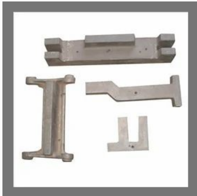
Industrial Non Ferrous Castings