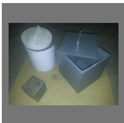
Lead Containers & Casks