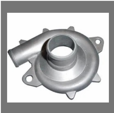
Aluminum Sand Castings