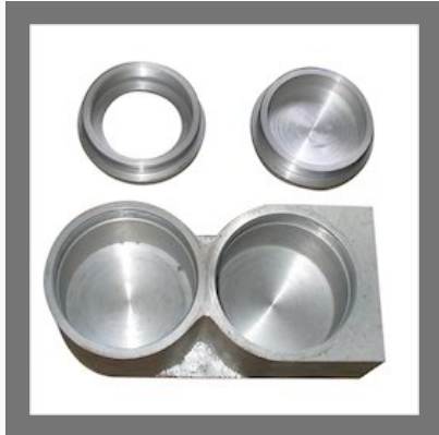
Casted Flameproof Equipment