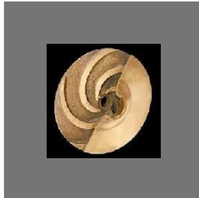
Phosphor Bronze Castings