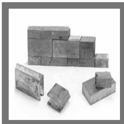
Interlocking Lead Bricks