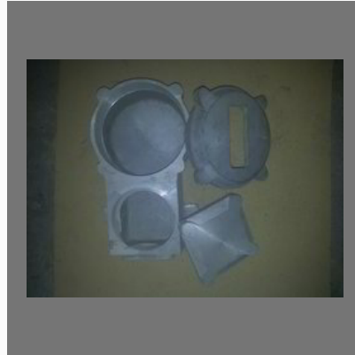
Aluminum Casted Enclosures