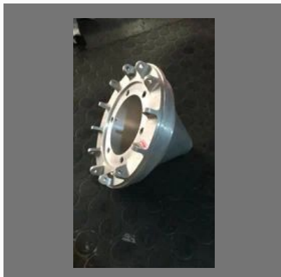
Cnc Machined Components