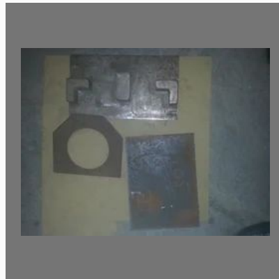
MS Casting for Lifting Lugs