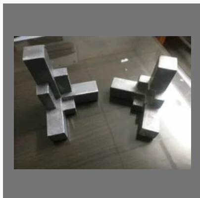
Container Corner Blocks