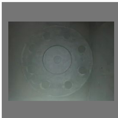
Aluminium Die Casting Parts