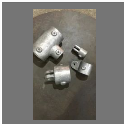
Scaffolding Jack Accessories