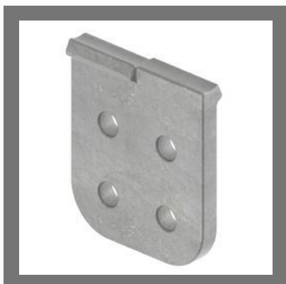
Aluminium Gravity Die Casting