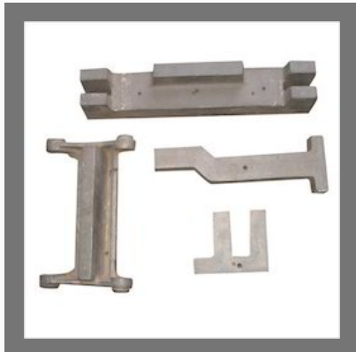
Industrial Non Ferrous Castings