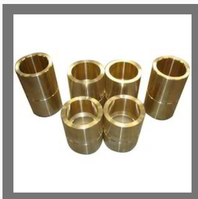
Casted Gunmetal Bushes