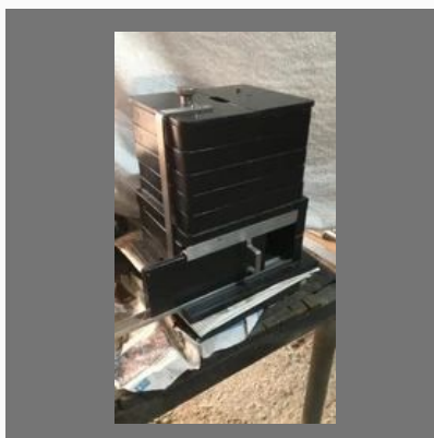
Lead Assemblies Lead shielding assembly