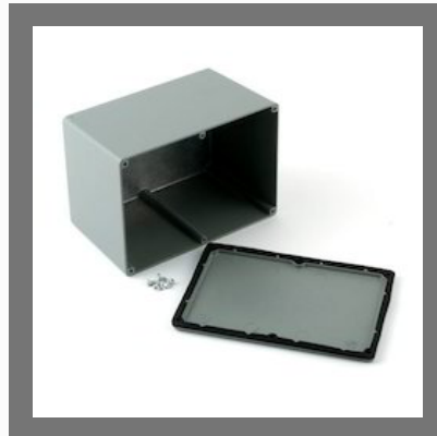
Aluminum Casted Boxes