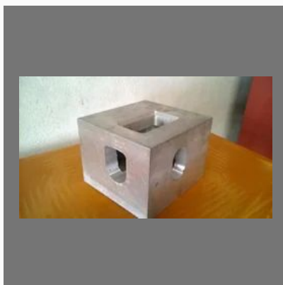
ISO 1161 Corner Casting