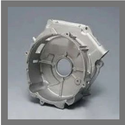
Aluminum Die Casting