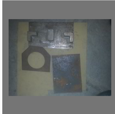
MS Casting for Lifting Lugs