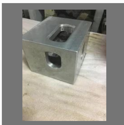
Container Corner Casting