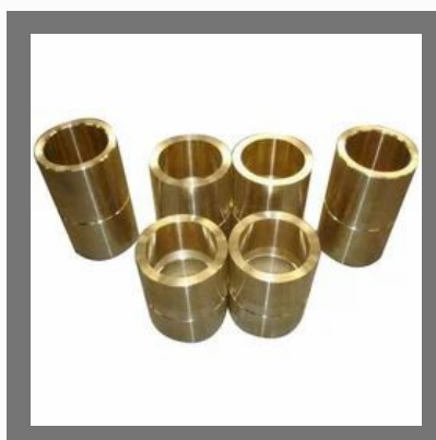
Casted Gunmetal Bushes