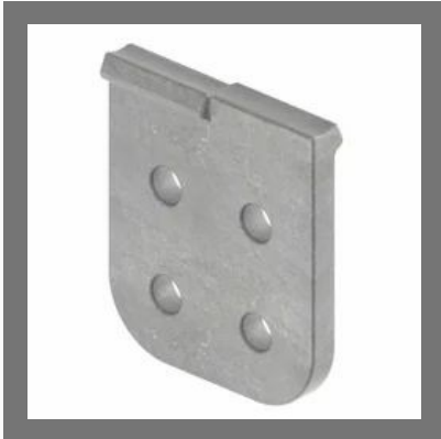
Aluminium Gravity Die Casting