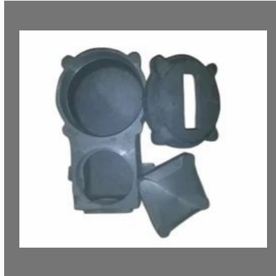
Aluminum Casted Enclosures