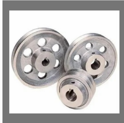
Aluminium Timing Pulleys