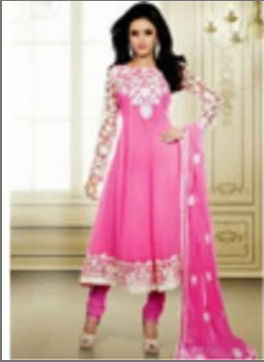
Embroidered Salwar Kameez