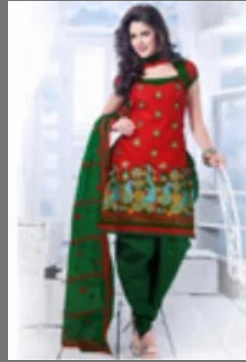
Cotton Salwar Kameez