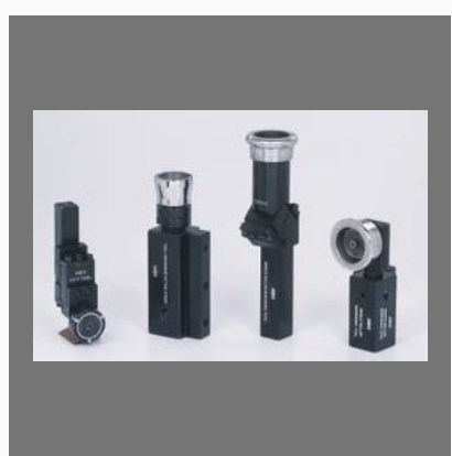
Single Roller Burnishing Universal