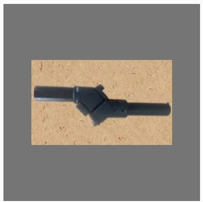
Diamond ID Burnishing Tool