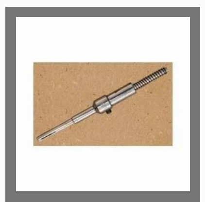
With More Than One Cutting Stone