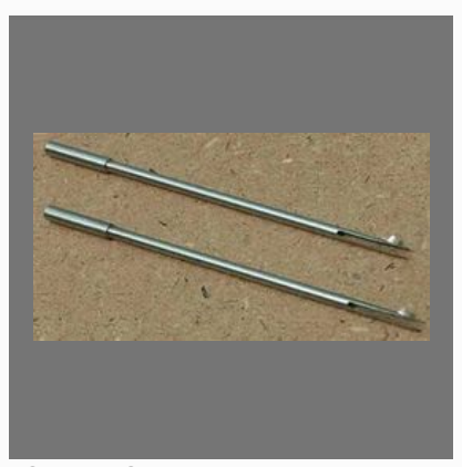
Single Cutting Edge