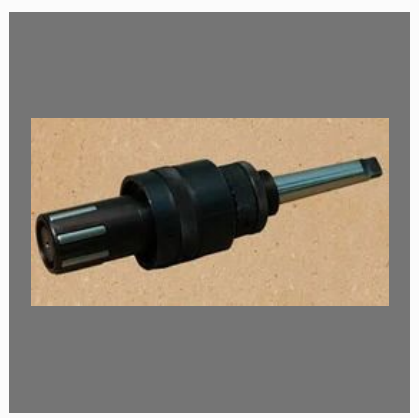
Thru Bore Multi Roller Burnishing Tool