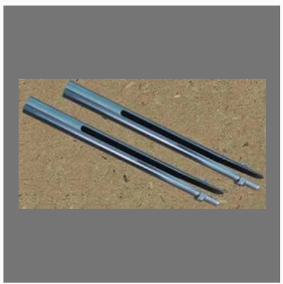
Double Cutting Edge