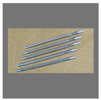
Single Pass Honing Tool