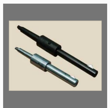
Front and Back Deburring Tool