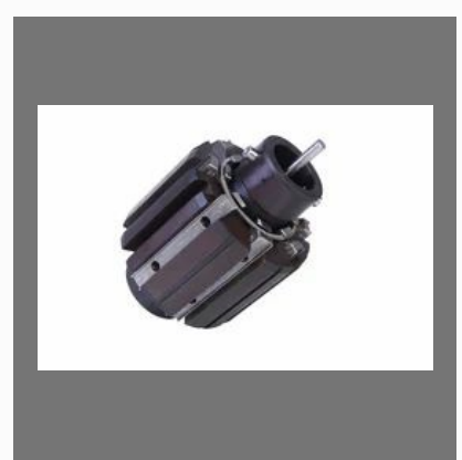
Multi Cutting Stone With Floating Holder