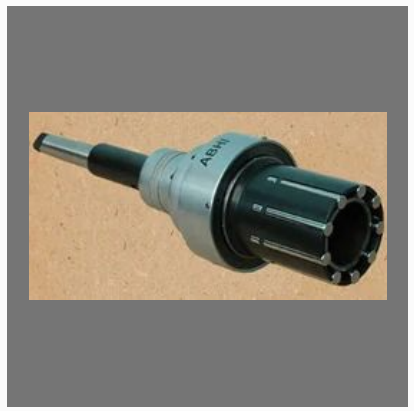
Multi Roller Burnishing Blind Bore