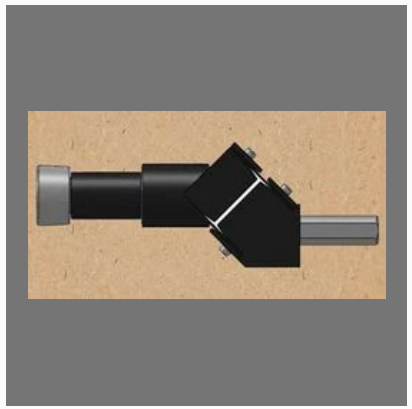
Single Roller Burnishing Blind Bore