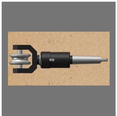
Spherical Roller Burnishing Tool