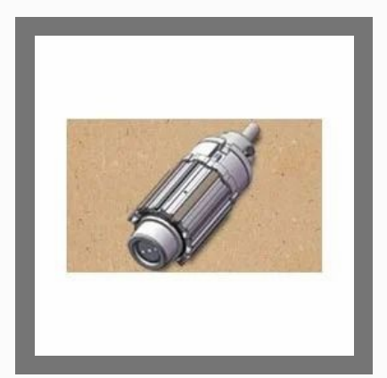
Multi Cutting Stone With Auto Gauging