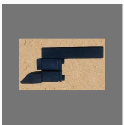
Diamond OD Burnishing Tool