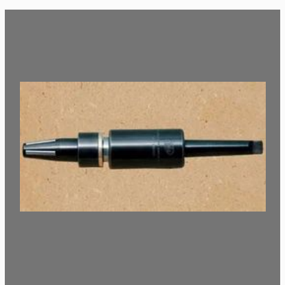
ID Taper Burnishing Tool