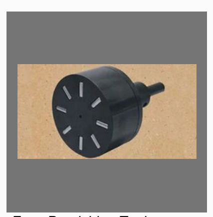
Face Burnishing Tool