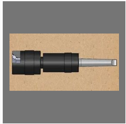
OD Taper Burnishing Tool