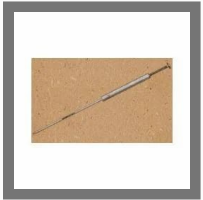
Single Stone Thru Bore Honing Tool