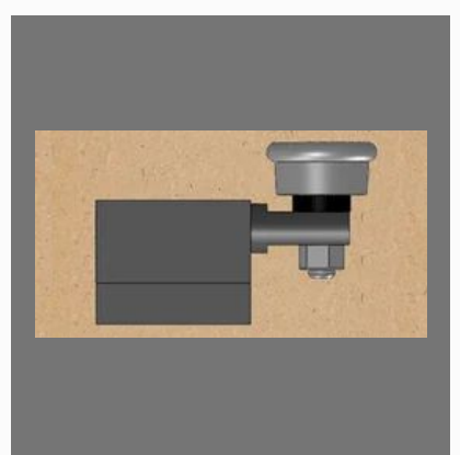
Single Roller Burnishing Plain Shaft