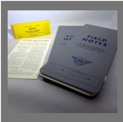
Customized Reporter Pads