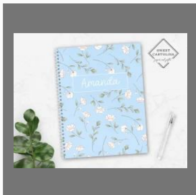
Custom Spiral Notebooks