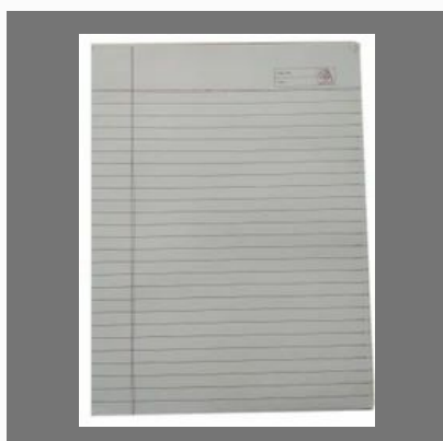
Writing Ruled Papers