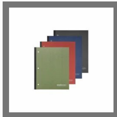
Composition Student Notebooks