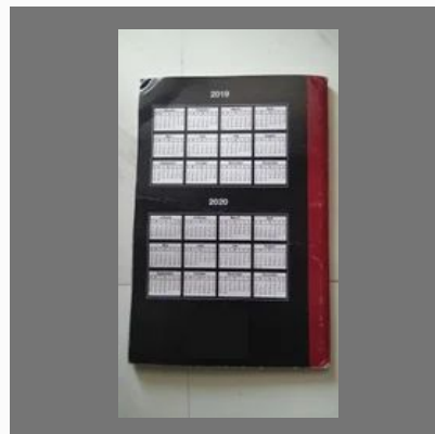
Counter Note book