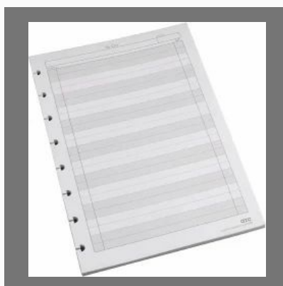
Customized Filler Papers