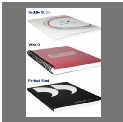
Perfect Bind Notebooks