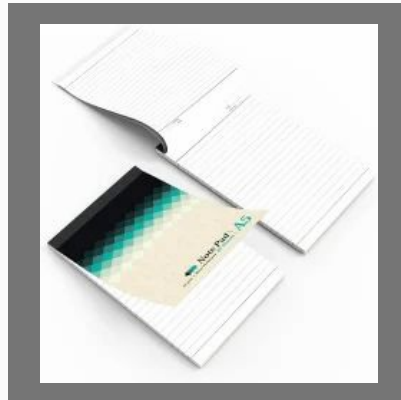
Scribbling Paper Pad