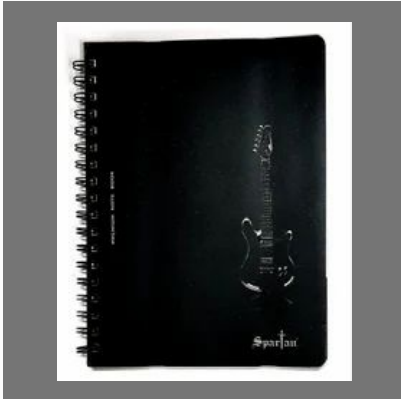
Wiro Bound Notebooks