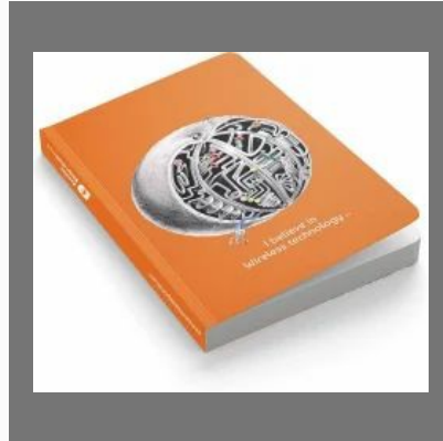
Wireless Note book