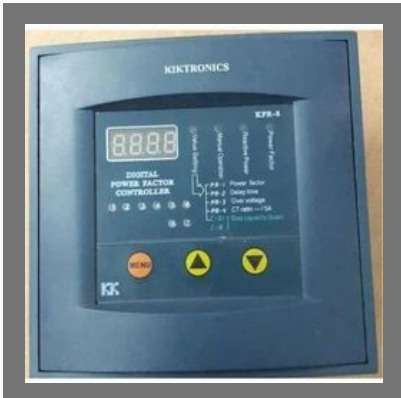
Power Factor Controller