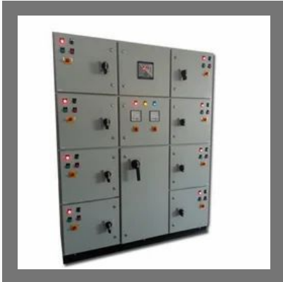
Automatic Capacitor Panels