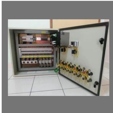
Control Panel Board