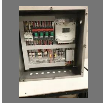
Solar Control Panel