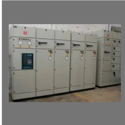
Automatic Control Panels