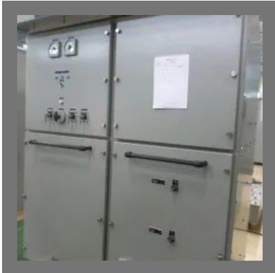
Outdoor Power Panel