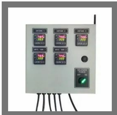
Temperature Control Panels