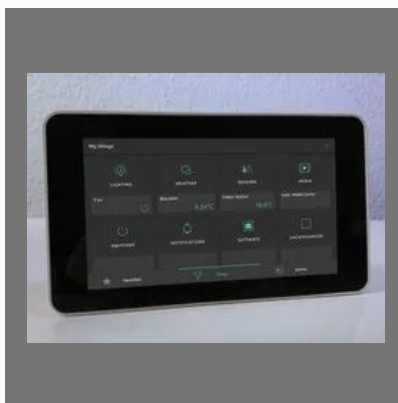
Touchscreen Control Panel