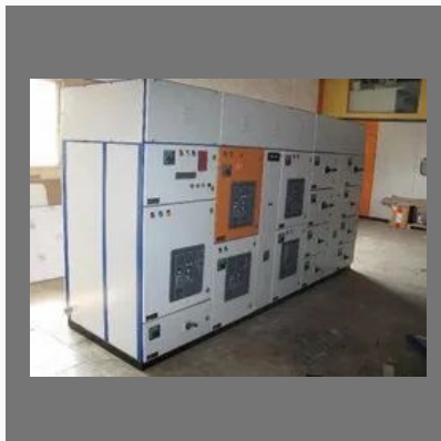
Power Control Center