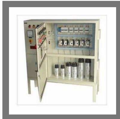
APFC Control Panel