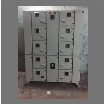
Meter Panel Board