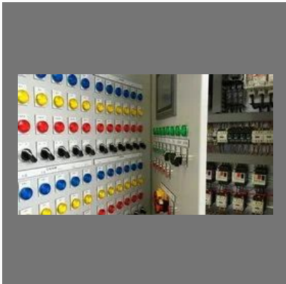
Remote Control Panels