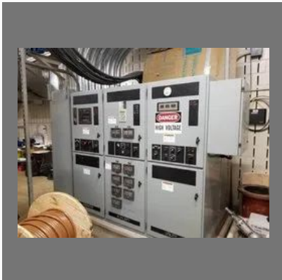
Generator Control Panel