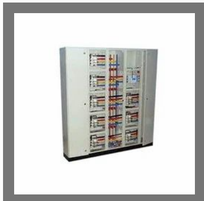
Industrial LT Panel