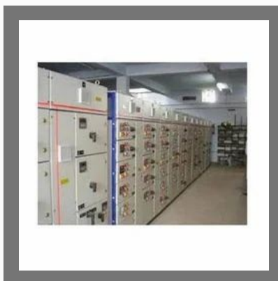
Industrial Distribution Panel