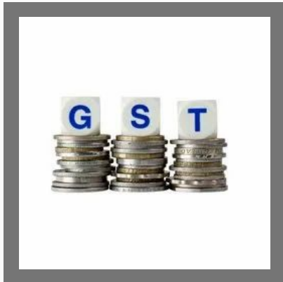
GST Return Filing Services