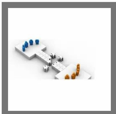
Merger And Acquisitions Advisory Services