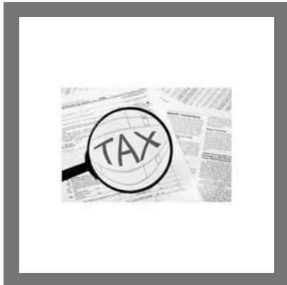
Tax Audits Service