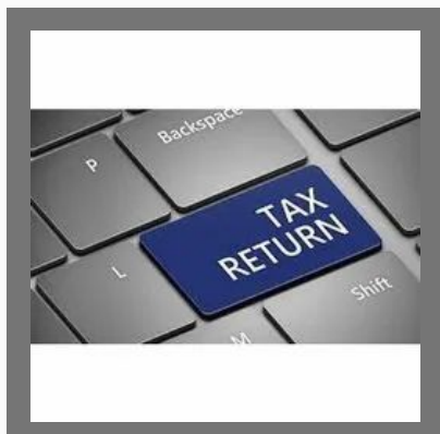
Income Tax Returns and Consultancy