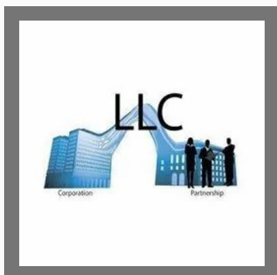
Business Valuation Services