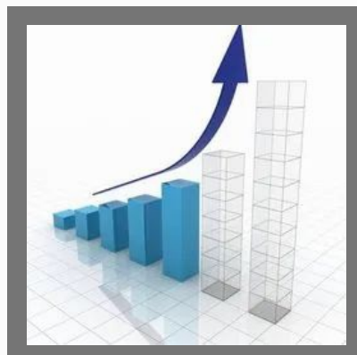
Shares Valuation Services