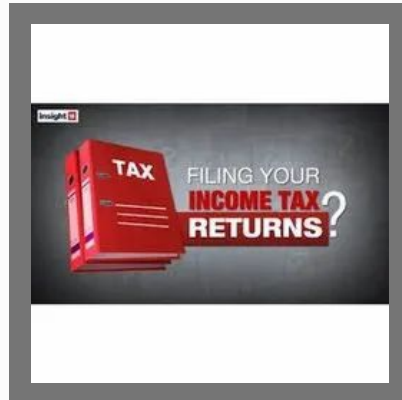
TDS and Capital Gain Tax Consultancy