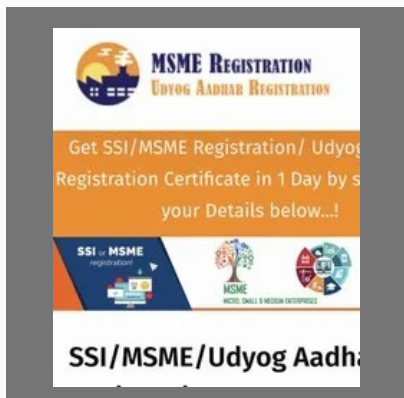
Msme Registration Services