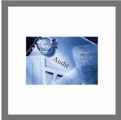
Statutory Auditing Services