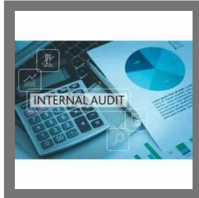
Internal Auditing Service