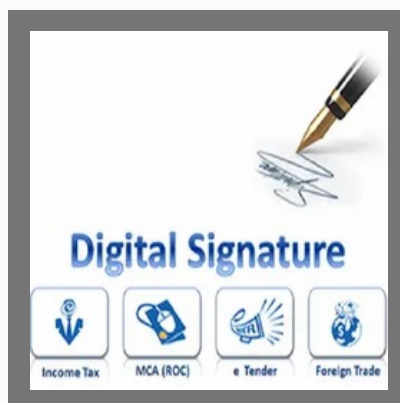
Digital Signature Services