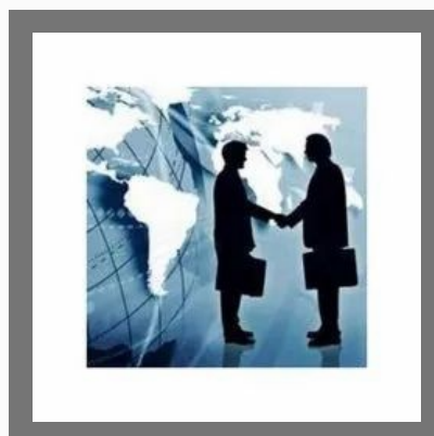
Joint Venture Consultants