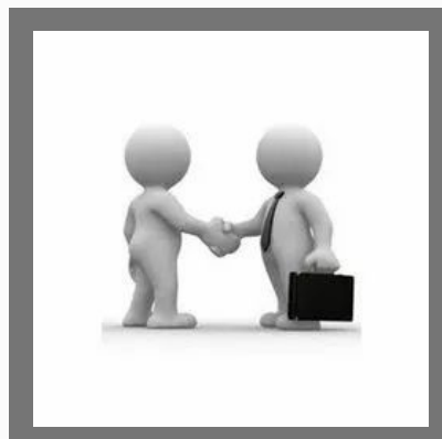
Business Incorporation Services