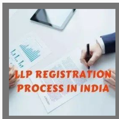
LLP Registration Service