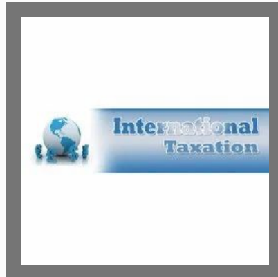
International Taxation Service