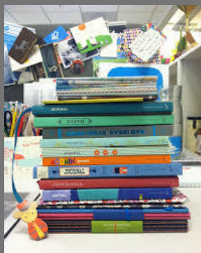
Finalizing Of Books And Stationery