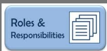
Roles and Responsibilities