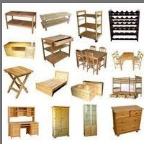
Furniture Design Service