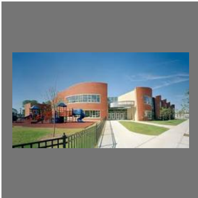
Designing Of The School Building