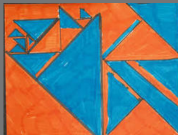
Framing Of The Curriculum