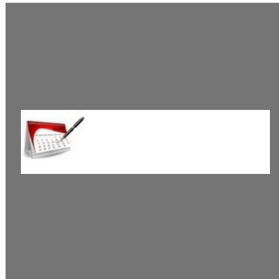
Setting Up The Time Table