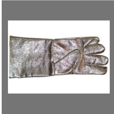
High Temperature Gloves