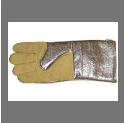
High Temperature Gloves