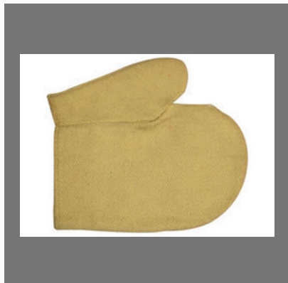
High Temperature Gloves