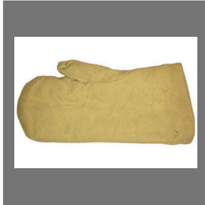
High Temperature Gloves