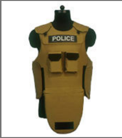
Light Tactical Vests