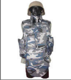
Tactical Military Vests