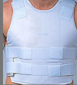
Light Tactical Vests Polyethylene