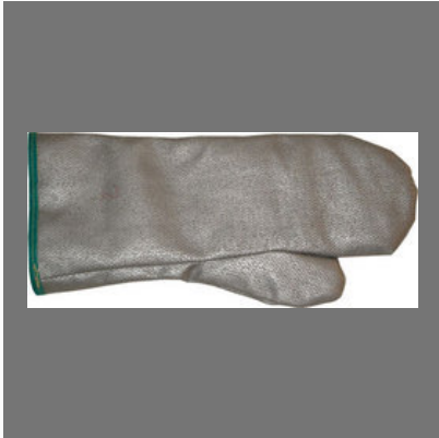
High Temperature Gloves