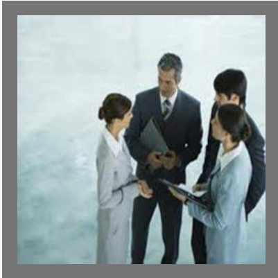
Corporate Advisory & Services