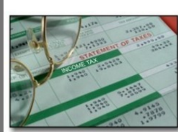
Taxation Advisory Services