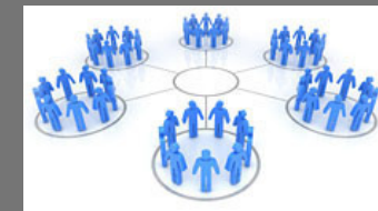
Business Process Outsourcing