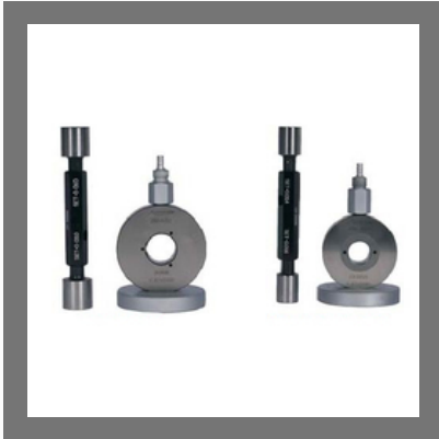
Air Ring Gauge