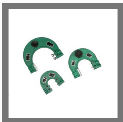
Adjustable Snap Gauge