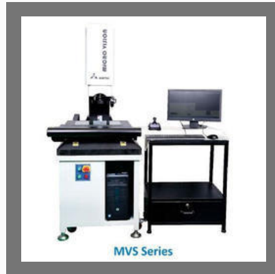
Micro Vision System (Fully Automatic)