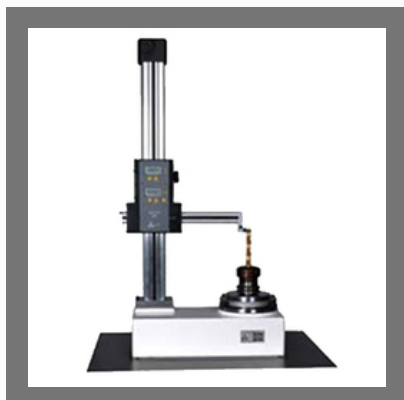
Tool Set Measuring Instrument