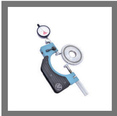
Span Snap Gauge