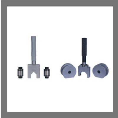
Air Snap Gauge