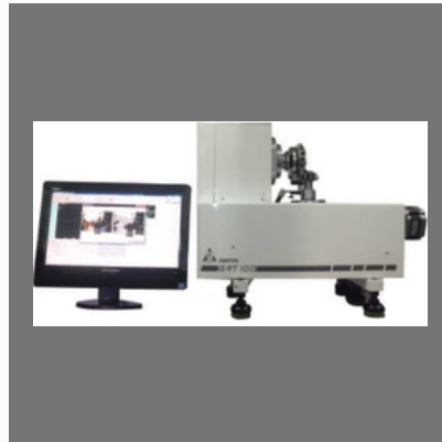
CNC & Automatic Bevel Gear Roll Tester (Model GRT B100)