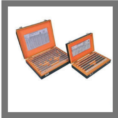
Slip Gauge Blocks