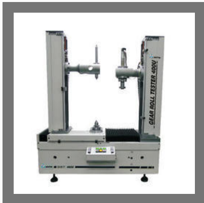
CNC Universal Gear Roll Tester