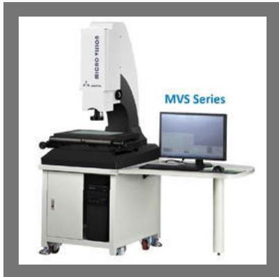
Micro Vision System