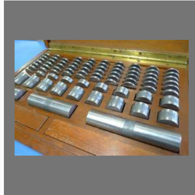
Long Gauge Block