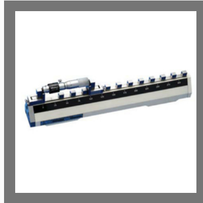
Inside Micro Checker