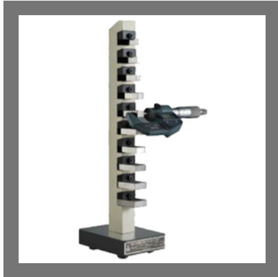
Micrometer Check Set