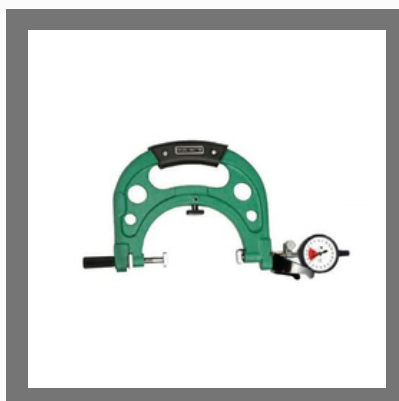
Dial Snap Gauge