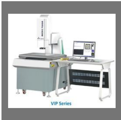
Micro Vision System - VIP Series (Fully Automatic)