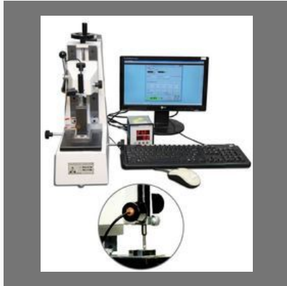
Gauge Block Comparator