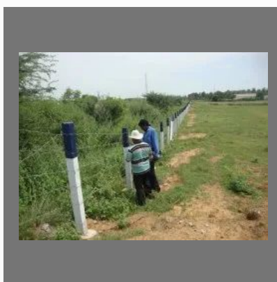
Land Fencing Solutions