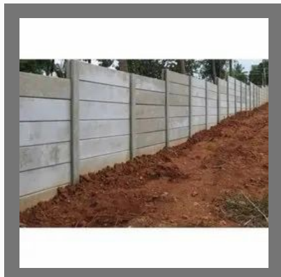
RCC Cement Walls