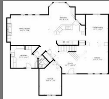
Building Survey Service