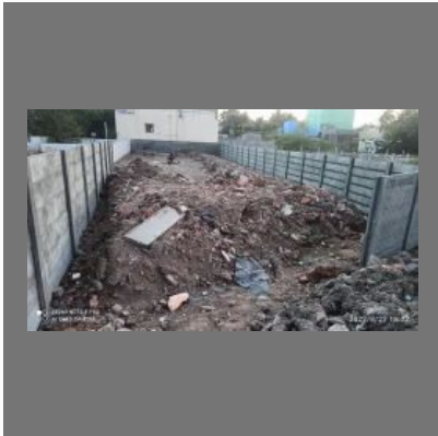
Precast Concrete Wall