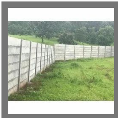
Plain Industrial RCC Compound Wall, Thickness 50MM