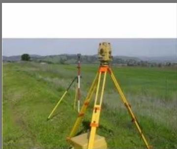
Land Surveyor Service