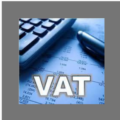
Vat Consultant/ Vat Registration