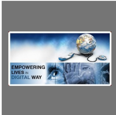
Digital Signature Certificates