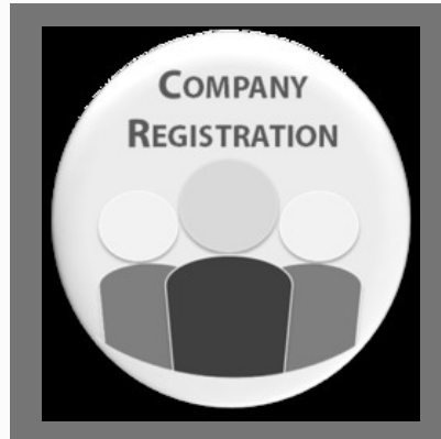
Company Incorporation , LLP, One Person Company