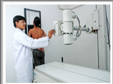
Physiotherapy Treatment Service