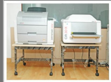
Psychology Treatment Service