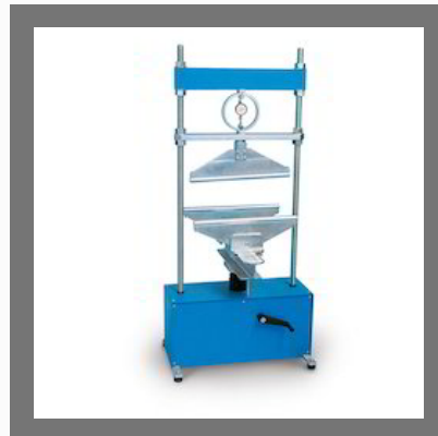
Tile Flexure Testing Machine