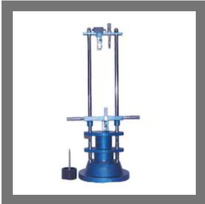
Impact Value Testing Machine