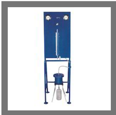
Concrete Permeability Apparatus - Single Cell