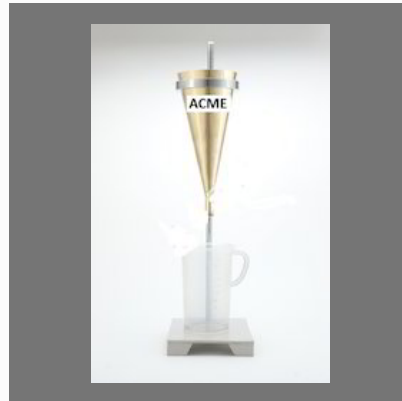
Marsh Cone Testing Equipment