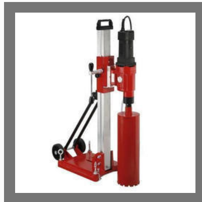
Core Cutting Machine