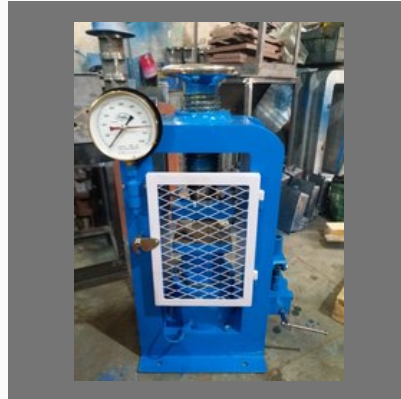
Channel Type Load Frame