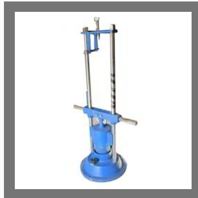
Aggregate Impact Tester IS: 2386 - Part - IV