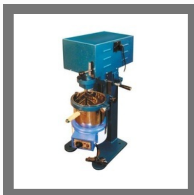
Bench Mounting Asphalt Mixer