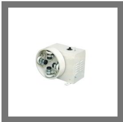
Stripping Value Apparatus