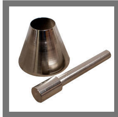
Sand Absorption Cone