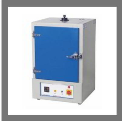
Digital Hot Air Oven