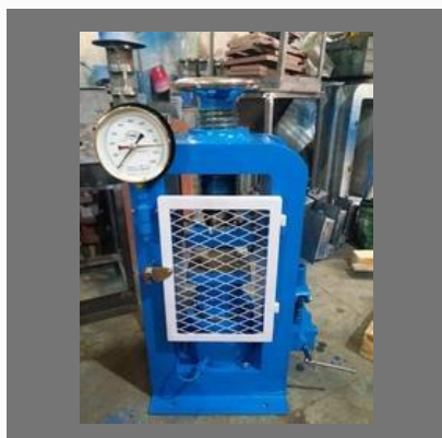
Cube Testing Machine