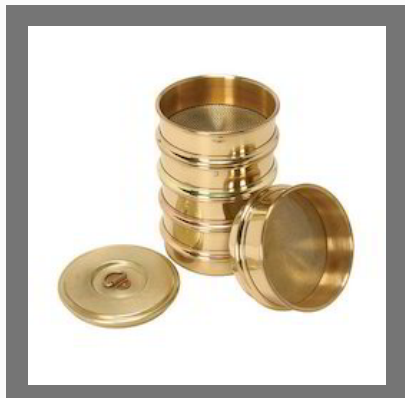
Brass Frame Sieves