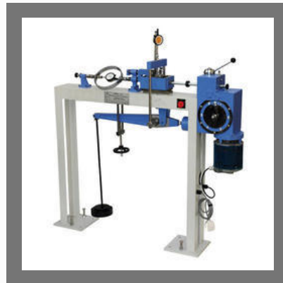
Direct Shear Apparatus