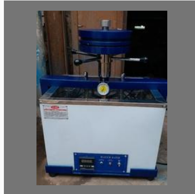
Mastic Hardness Tester