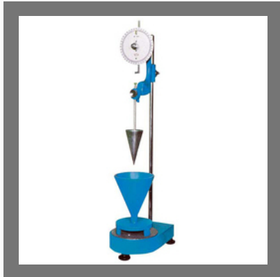
Soil Penetrometer Hand Operated