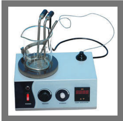
Ring And Ball Apparatus