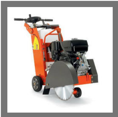
Electrical Rock Concrete Cutting Machine