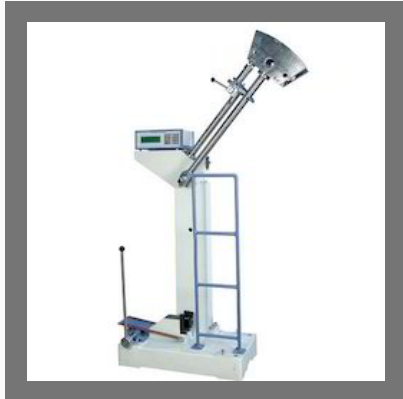
Pendulum Impact Testing Machine