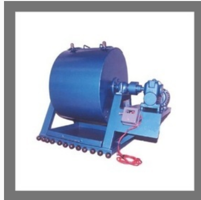
Los Angeles Abrasion Apparatus