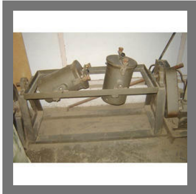
Deval Attrition Tester