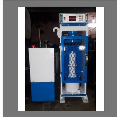
Automatic Compression And Flexural Machine Acme-651