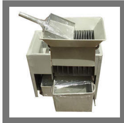
Riffle Sampler Divider Is: 1607: 1960