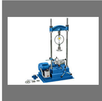
Unconfined Compression Apparatus