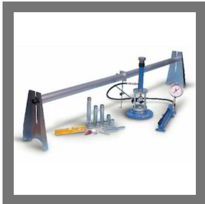
Plate Bearing Test Apparatus