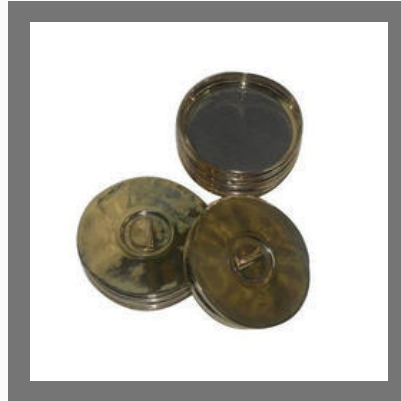
Standard Test Sieves