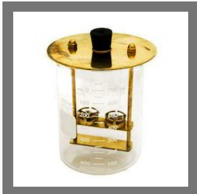
Ring And Ball Apparatus Is: 1205- 1958