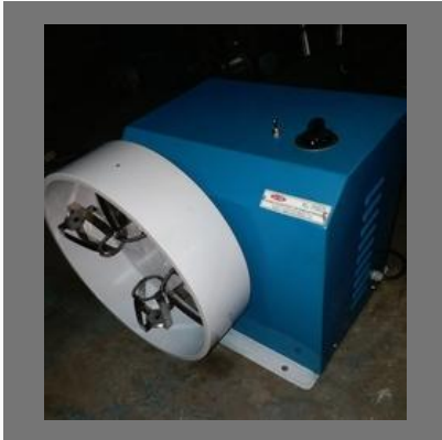
Film Stripping Test Machine