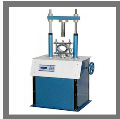
Marshall Stability Test Apparatus