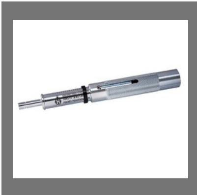
Pocket Concrete Penetrometer