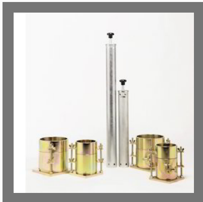
Heavy Compaction Testing Equipment IS: 2720 - Part - VIII