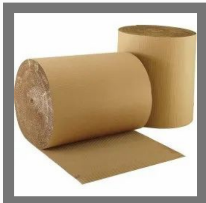
Corrugated Paper Rolls