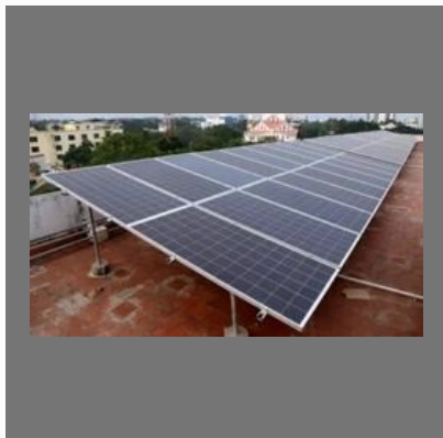
Polycrystalline Solar Panel