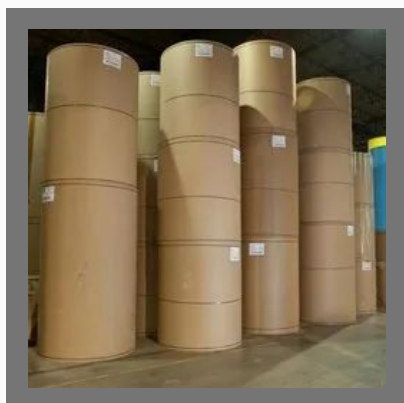
Brown Kraft Paper Roll