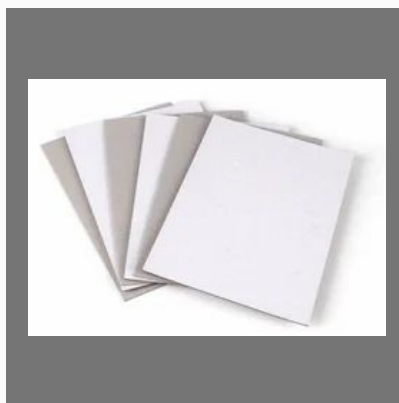
Coated Duplex Paper Coated Duplex Paper