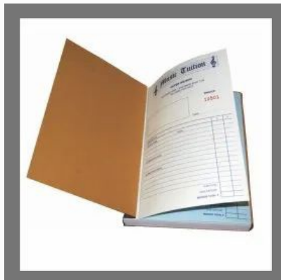
Invoice Bill Book