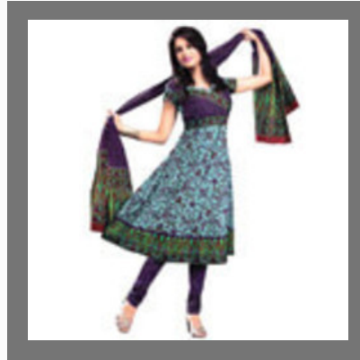
Cotton Dress Material