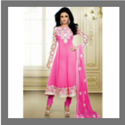
Embroidered Salwar Kameez