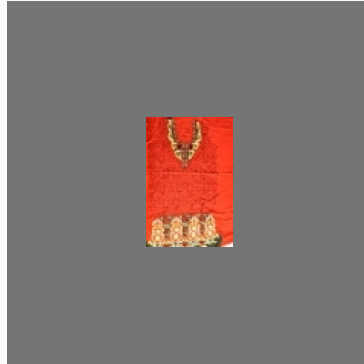
Red Georgette Suits