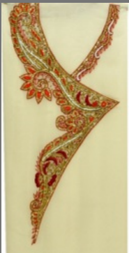
Unstitched Georgette Suit