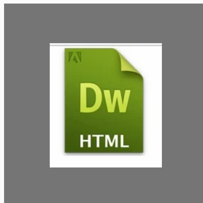
DW HTML Courses