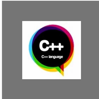
CC Plus Plus Courses