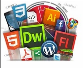
Web Designing Course