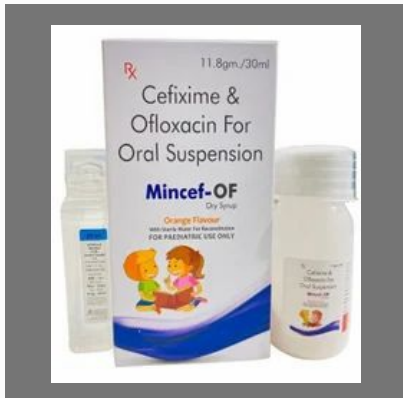
Mincef OF Cefixime Ofloxacin Dry Syrup