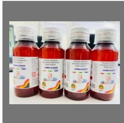
Paracetamol Phenylephrine Hydrochloride