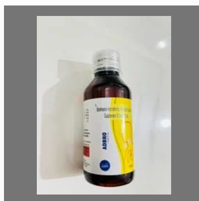
Bromhexine Hydrochloride Syrup