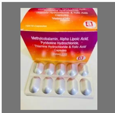
Veins OD Methycobalamin Capsule