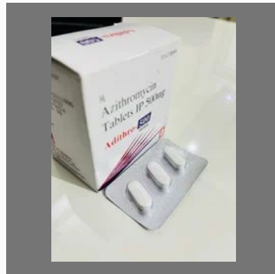
Azithromycin 500 Mg Tablets