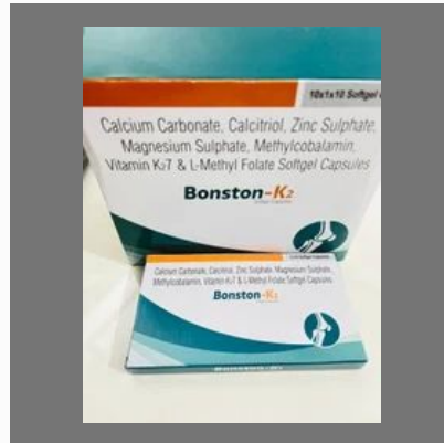
Calcium Carbonate Calcitriol Vitamin K2 7