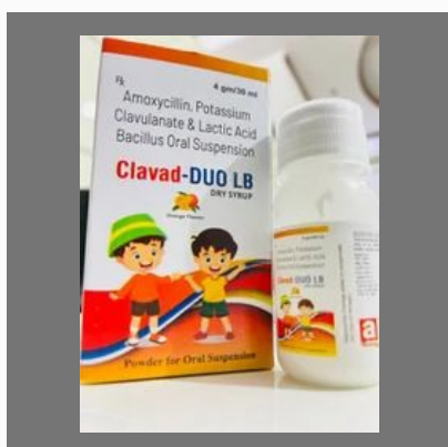
Amoxicillin Potassium Clavulanate Dry Syrup