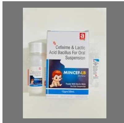
Cefixime Oral Suspension Ip Dry Syrup