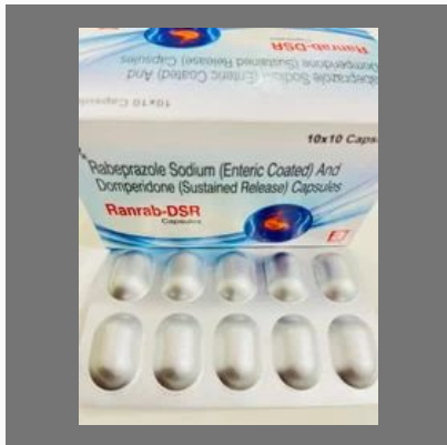
Ranrab DSR Rabeprazole Domperidone Capsule