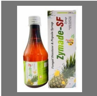
Zymade SF Digestive Enzyme Syrup