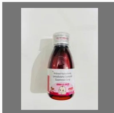
Levosambutamol Ambroxol Hydrochloride