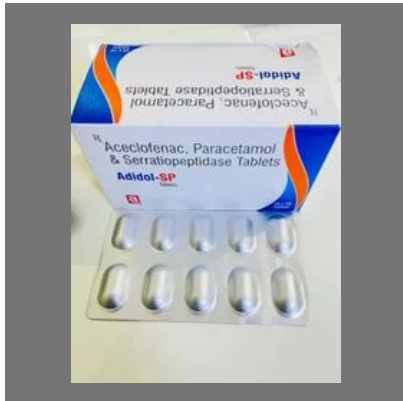
Adidol Sp Aceclofenac And Paracetamol Tablet