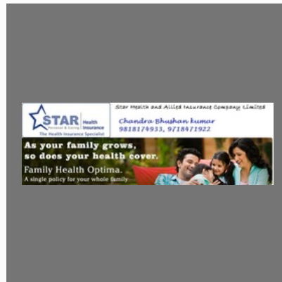
Mediclaim- Star Health