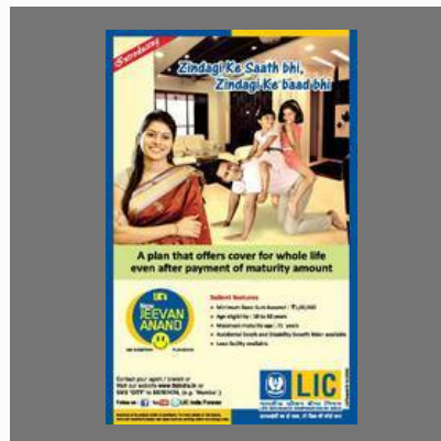
New Jeevan Anand