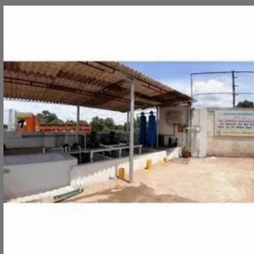
Effluent Treatment Plant