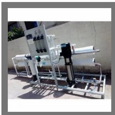
4000 LPH RO System