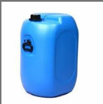
Oil Scale Cleaner