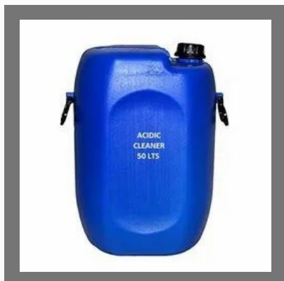
50L Acidic Cleaner