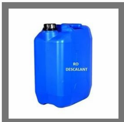
50L RO Descalant