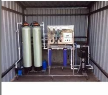
250 LPH RO System