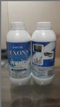
LEXONN Dairy Can Cleaner