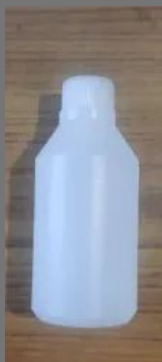
Lexonn Fat Testing Chemical (Fat-Fast 3 IN 1) Milko Fat Testing Chemical