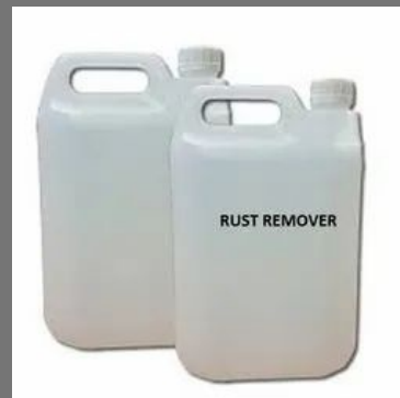
Rust Remover Chemical