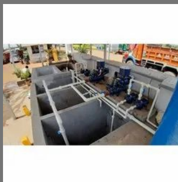
Sewage Treatment Plant