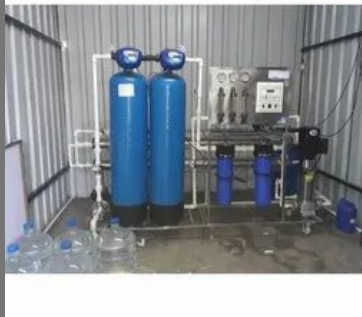
1000 LPH RO System