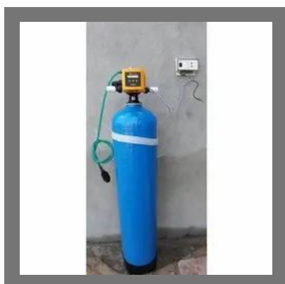
Automatic Water Softener