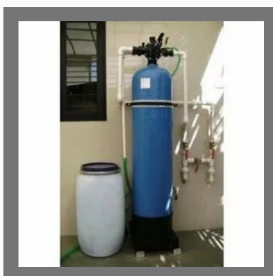
Manual Water Softener