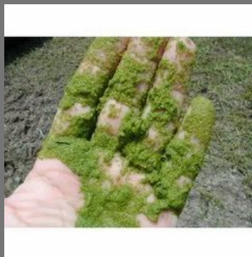
Algaecide Chemical (Aldox)