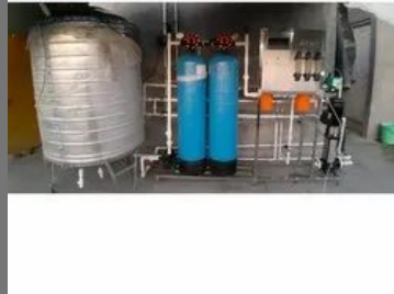
500 LPH RO System