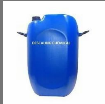
Descaling Chemical Compound BRAND CALGON 101