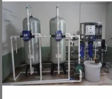
2000 LPH RO System