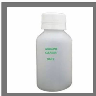
Milko tester chemicals Lexonn Daily 200 ML Alkaline Cleaner For Milk Analyser And Lactoscan Machines