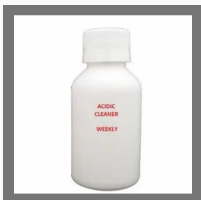
Milko tester chemical Lexonn Week 200 ML Acidic Cleaner For Milk Analyser And Lactoscan Machines