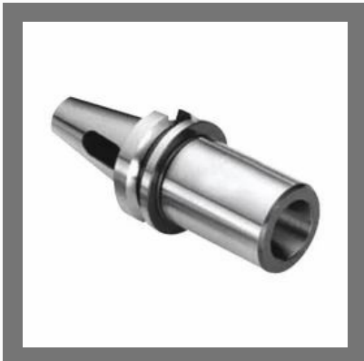
Morse Taper Adapter