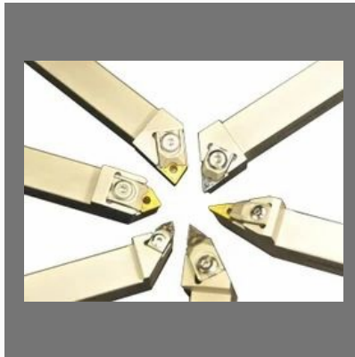
External Turning Tool Holder