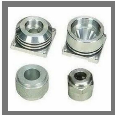
CNC Machined Components