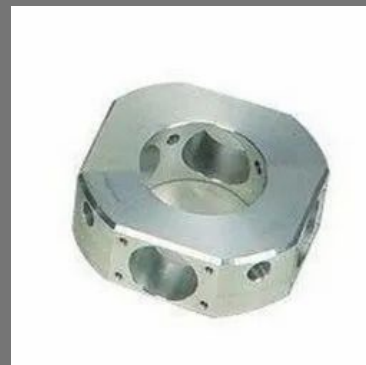
CNC Machined Components