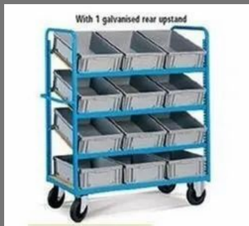
Material Movement Trolleys