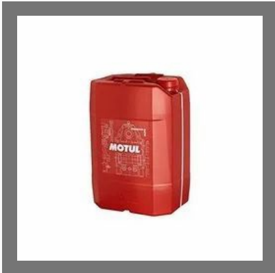
Modultech Rubric Hm 46