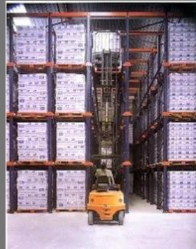
Drive In Pallet Racking