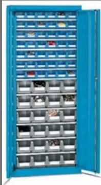
Bin Storage Cupboard