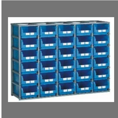
Bin Shelving Systems