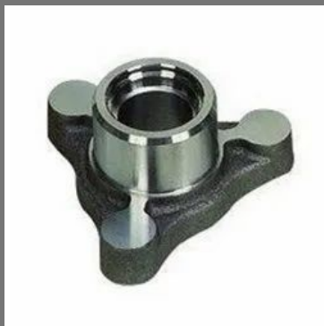
CNC Machined Components