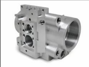
CNC Machined Components