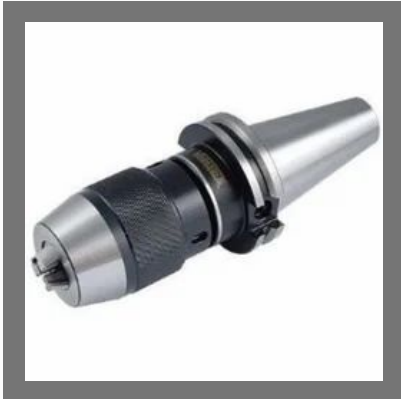
Drill Chuck Adapter