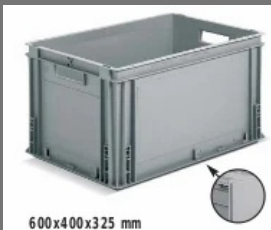
Polypropylene Plastic Bins