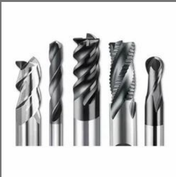
Solid Carbide Drills