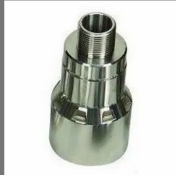
CNC Machined Components