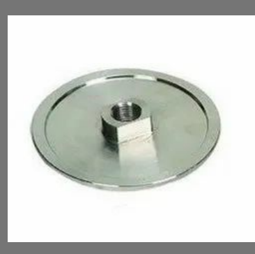
CNC Machined Components