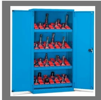
NC Tool Cabinets