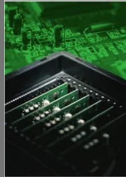
Esd Conductive Plastic Bins