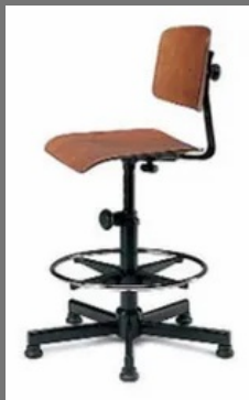
Shop Floor Seating (Swivel Chairs)