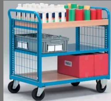
Material Movement Trolley