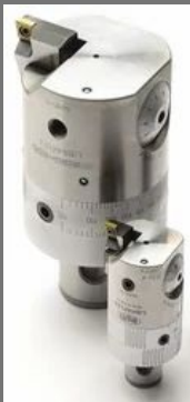
Fine Boring Head