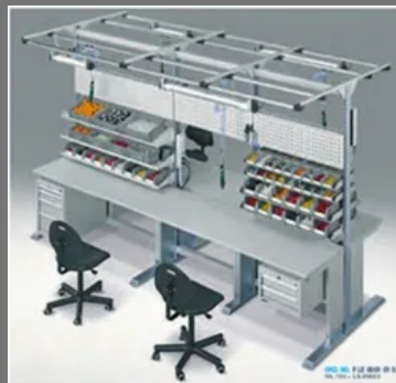
ESD Safe Workstation