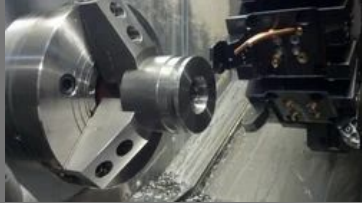
CNC Machined Components