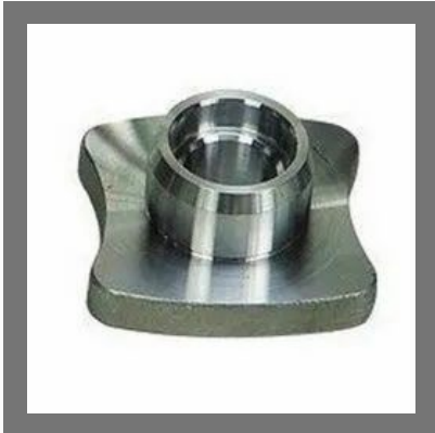
CNC Machined Components