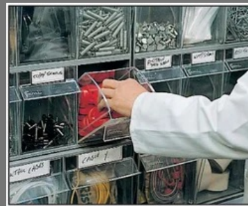
Small Components Storage Boxes