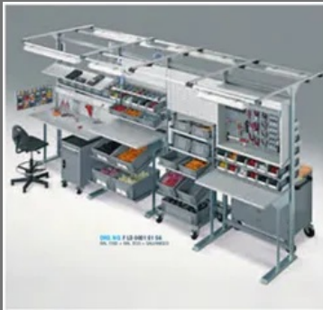
Modular Assembly Workstations