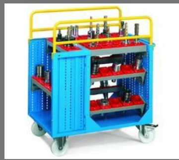
CNC Tool Trolley