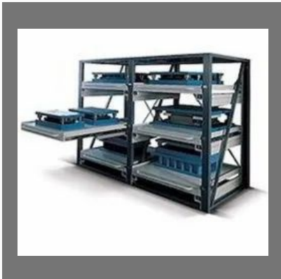
Die & Mould Storage Racks