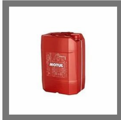
Motultech Rubric Hm 32