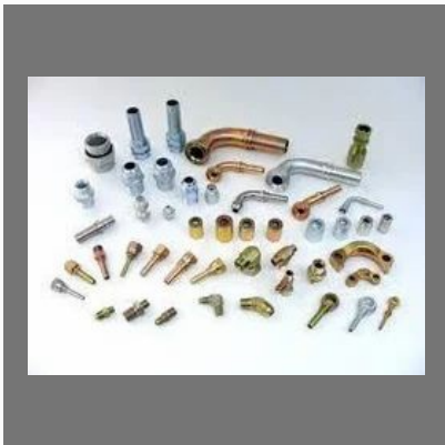
Hydraulic Hose Fittings