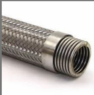
Assembly Corrugated Hoses