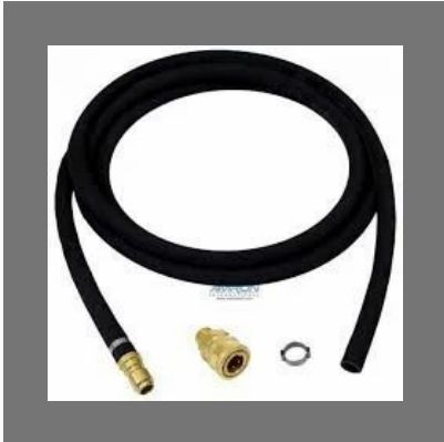
Exhaust Hose Assembly