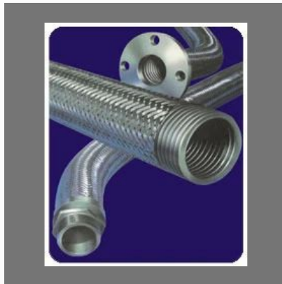
Stainless Steel Hose Assemblies