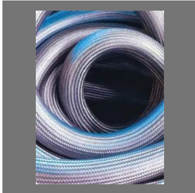
Stainless Steel Braid Hose