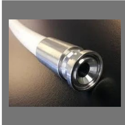
Assemblies Standard Hose End Fittings