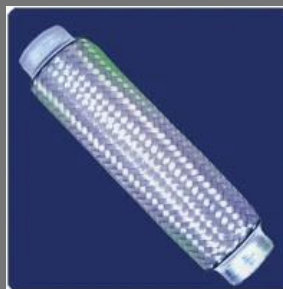
Automotive Exhaust Connector