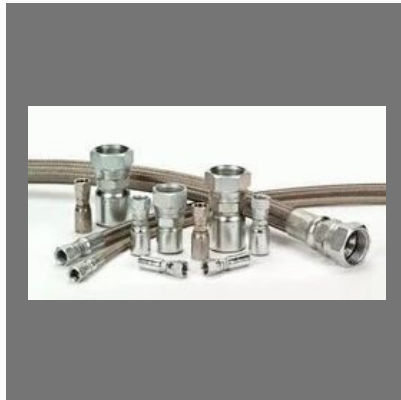
Stainless Steel Hydraulic Hoses