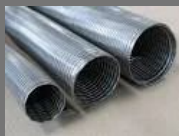
Double Interlock Hose