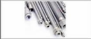
Square Lock Corrugated Hoses