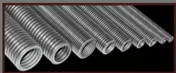
Mechanical Corrugated Hoses