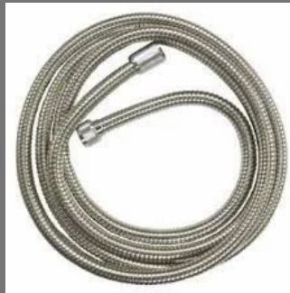
Single Interlock Hose