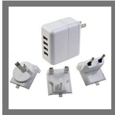
Plastic Housing for Chargers