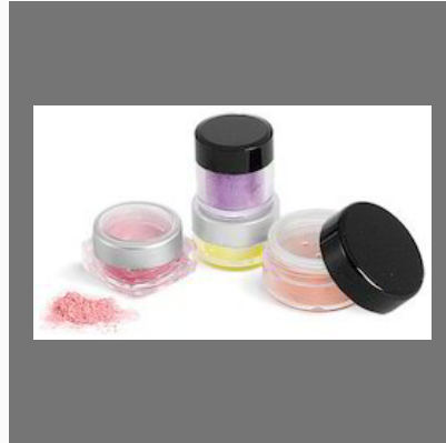
Plastic Injection Moulds For Cosmetic Container