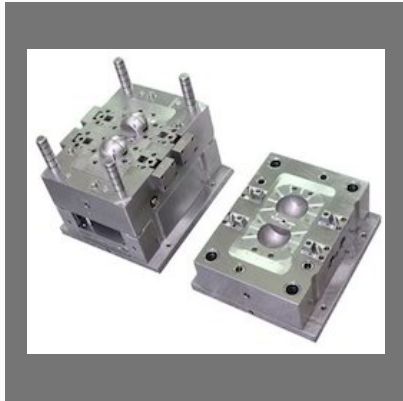
Plastic Molds for Plastic Components