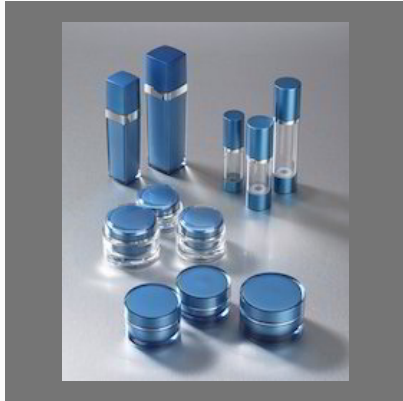
Plastic Containers for Cosmetics