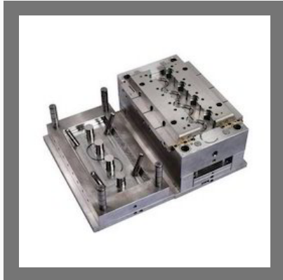
Plastic Injection Moulds for Caps