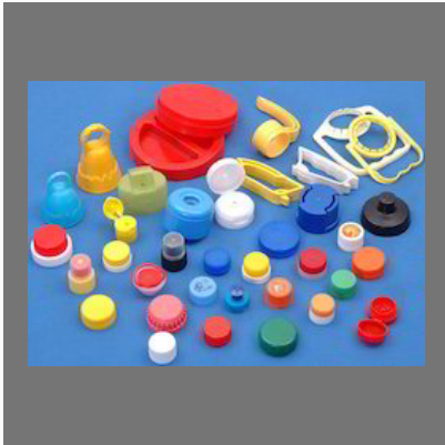
Plastic Bottle Caps