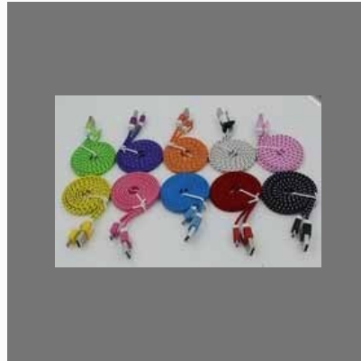
USB Data Cables