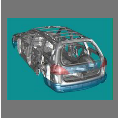
New Development CAD Designing