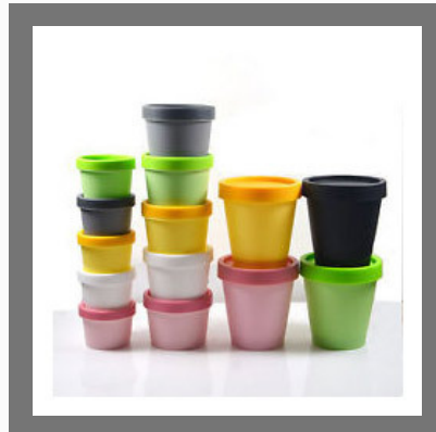
Plastic Molds For Cosmetic Containers