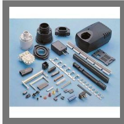
Plastic Injection Moulds for Electronic Parts