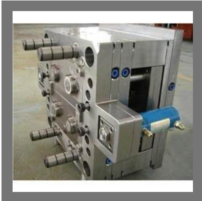
Plastic Molds for Caps