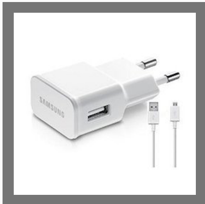
Android Phone USB Wall Charger