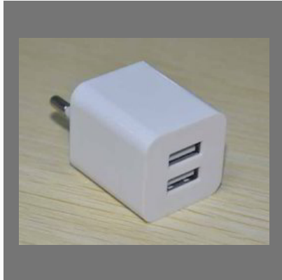
2 Ampere USB Wall Charger