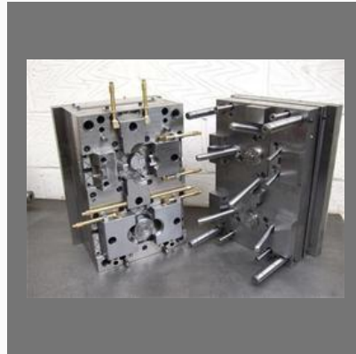
Plastic Injection Mould for Automobile Parts