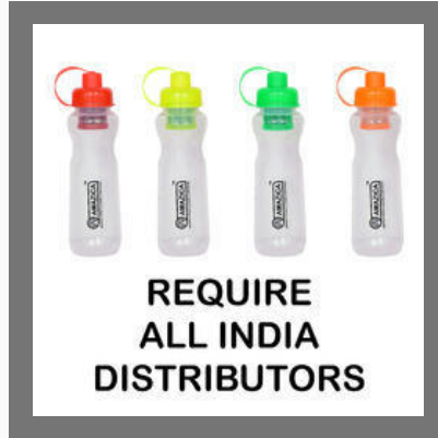
Plastic Sport Water Bottles