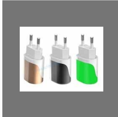
Apple Iphone USB Wall Charger