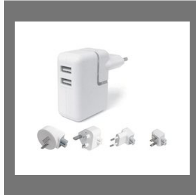
Plastic Molds for Chargers