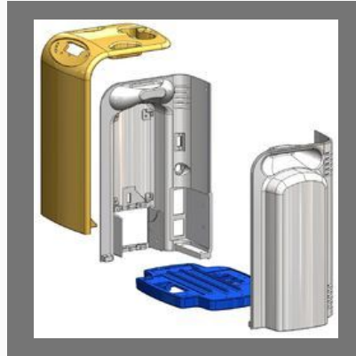
Assembly CAD Designing