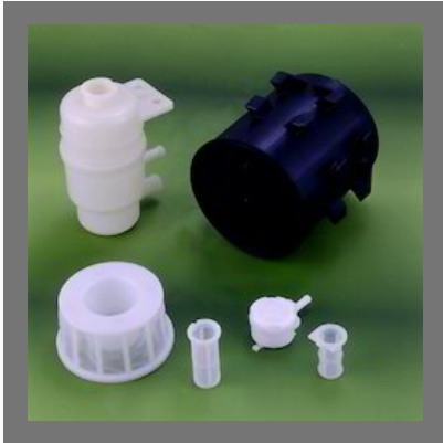
Plastic Components for Automobile Parts