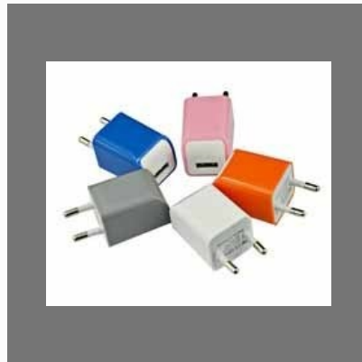
1 Ampere USB Wall Charger