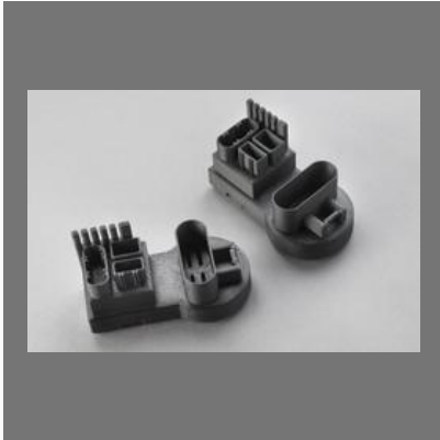
Part CAD Designing