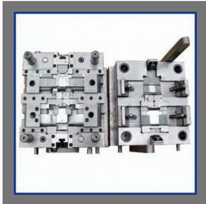
Plastic Injection Moulds for Plastic Parts