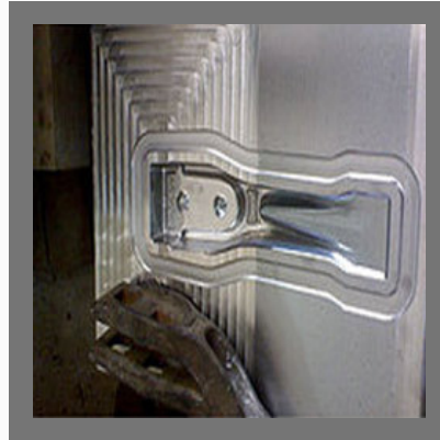
Die Casting Dies