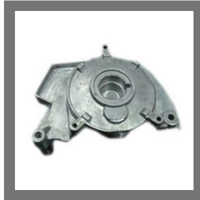
Power Tools Spares