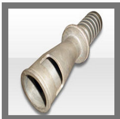
Automotive PDC Components