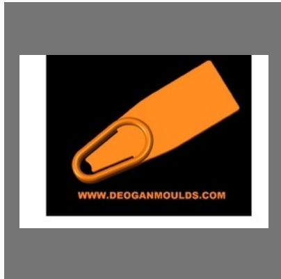
Bag Plastic Hooks