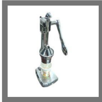
Juice Machines Parts