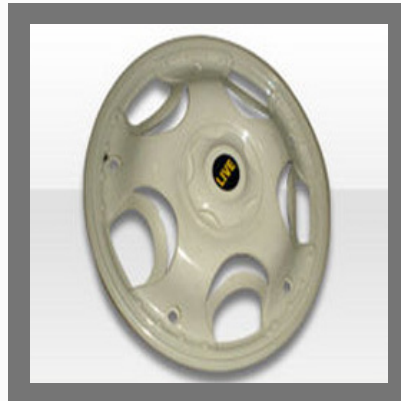
Plastic Auto Parts