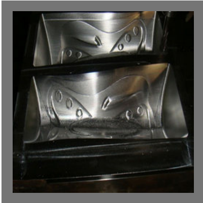
Industrial Injection Molding Dies