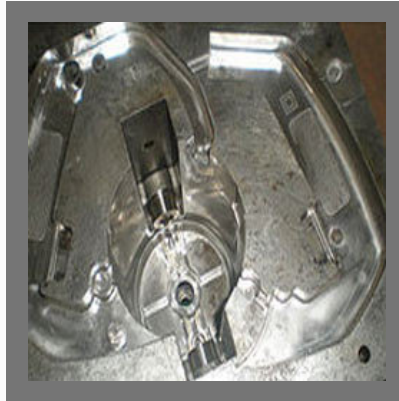
Plastic Injection Molding