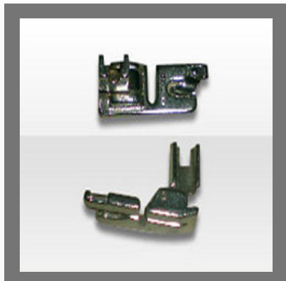
Sewing Machines Parts