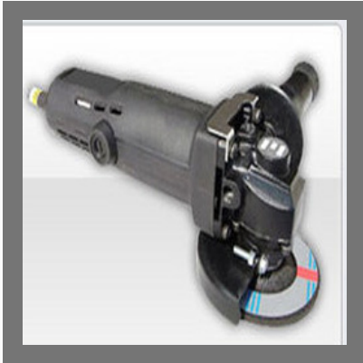
Power Tools Parts