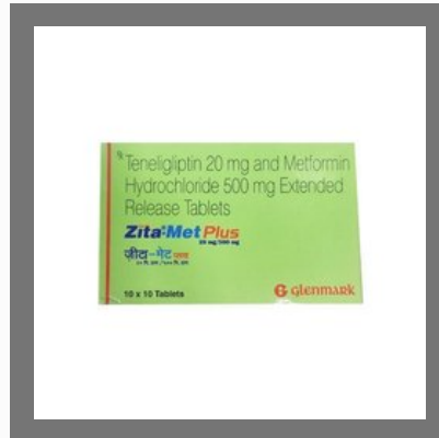
Zita Met Plus Tablet