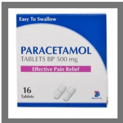
Paracetamol BP 500 mg Tablet