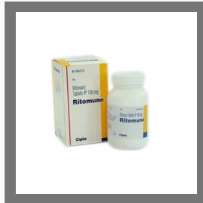
Ritonavir IP 100mg Tablets