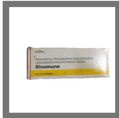
Rinomune Cold Tablet