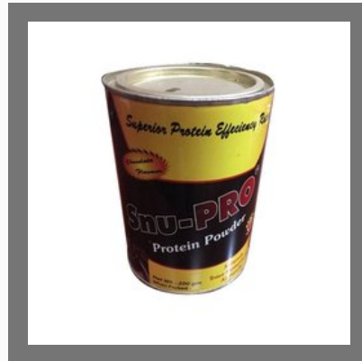
Whey Protein DHA