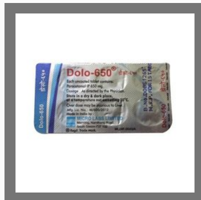
Dolo Paracetamol IP 650 Tablet