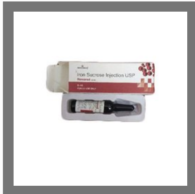
Revored 5ml Iron Sucrose Injection