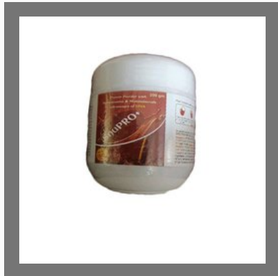
Whey Protein DHA