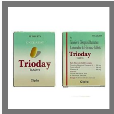
Trioday HIV Tablet