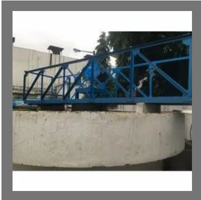
Wastewater Treatment Plant