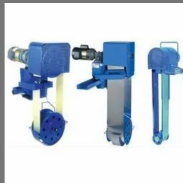
Stainless Steel Oil Skimmers