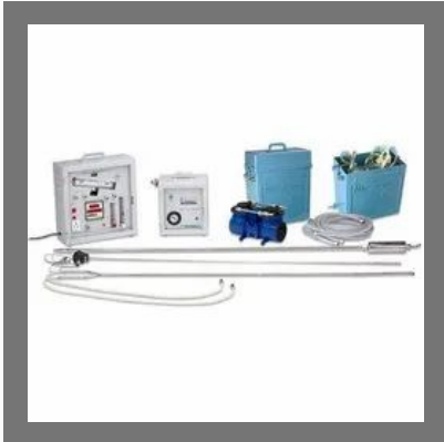
Stack Monitoring Services