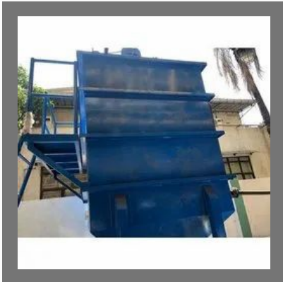
Stainless Steel Settling Tank