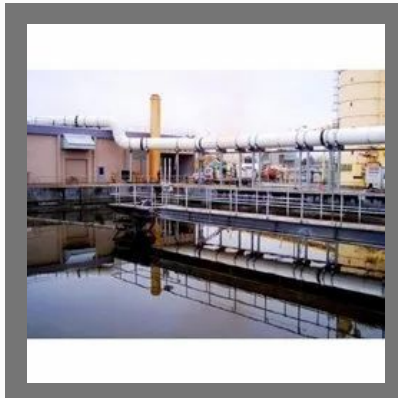
Effluent Treatment Plant