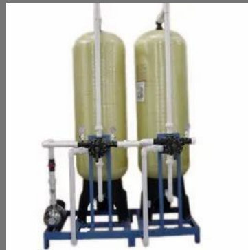
Activated Carbon Filter