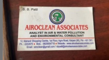
Environmental Monitoring Service