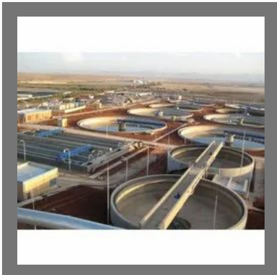
Sewage Wastewater Treatment Plant