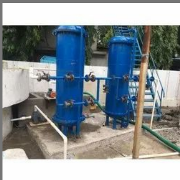
Industrial Carbon Filter