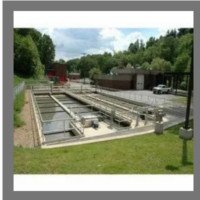
Sewage Treatment Plant