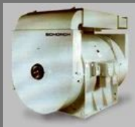
High Voltage Explosion Protected Pressurised Enclosure