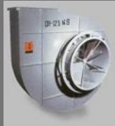
Fans Smoke Exhausters