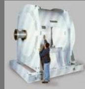
Highvoltage Tube Cooled Machines To Drive Reciprocating Compressor