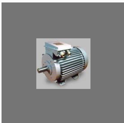
Low Voltage Induction Motors