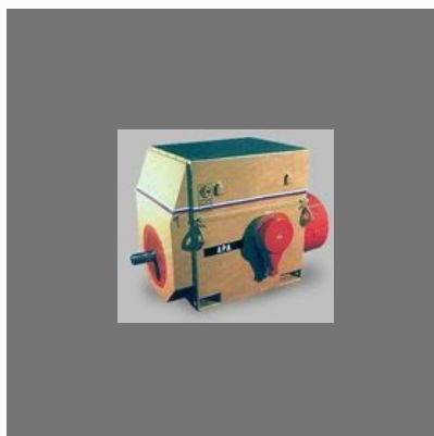
Highvoltage Inducation Motors