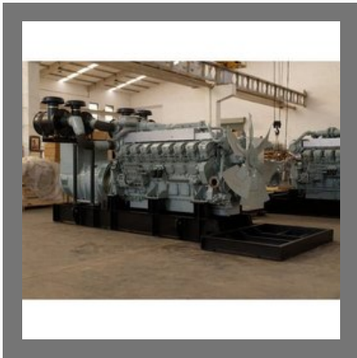
Engineering Insurance Claims