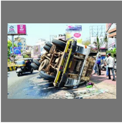
Marine Insurance Claims