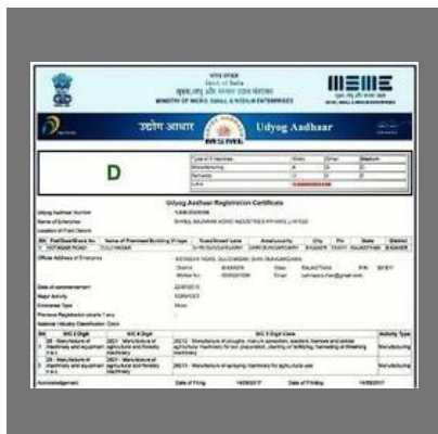
MSME / SSI Certification