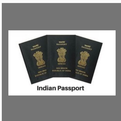
Passport (Fresh / Renewal)