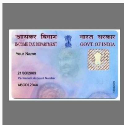
Pan Card Service