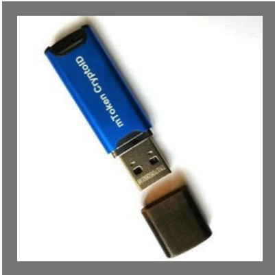
Digital Signature Certificate