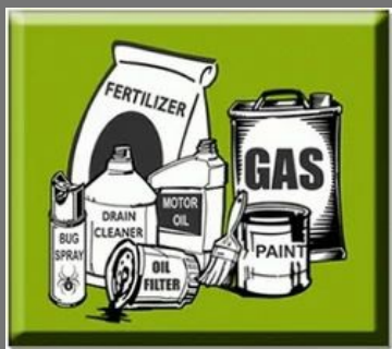
Restriction Of Hazardous Substances