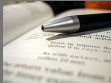
International Organization For Standardization