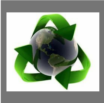
Corporate Social Responsibility