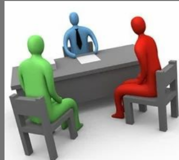
Quality Management System