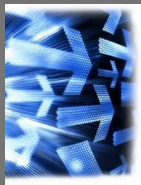
Guidelines For Configuration Management