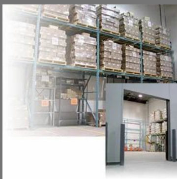
Good Manufacturing Practice