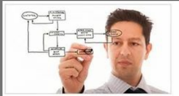
ISO Certification Training