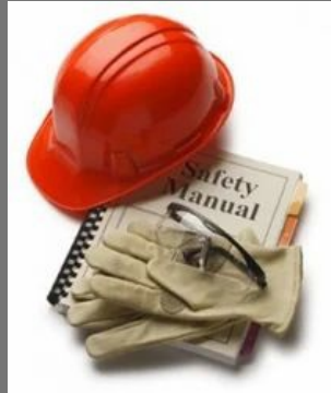
Occupational Health & Safety Management System