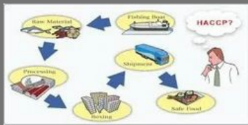
Hazard Analysis And Critical Control Points