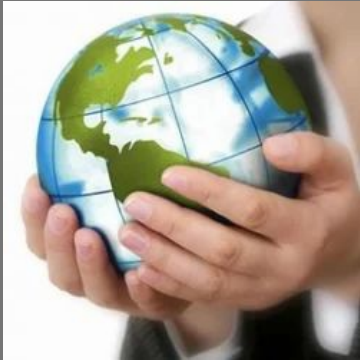
Quality Management System