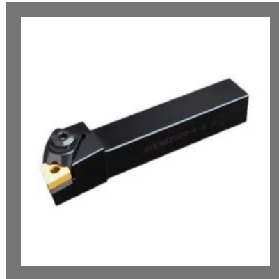
CNC Tool Holders