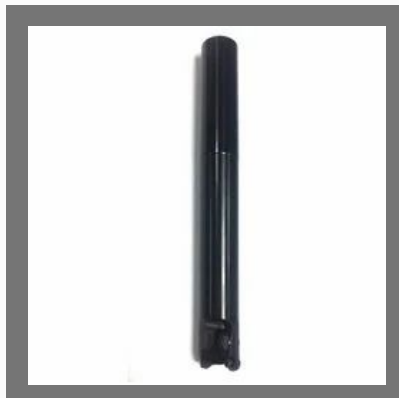
Die Cutting Tools