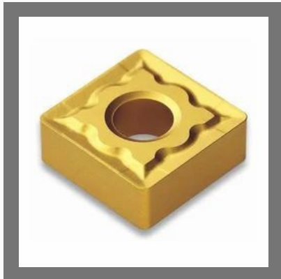
B25 Carbide Turning Insert