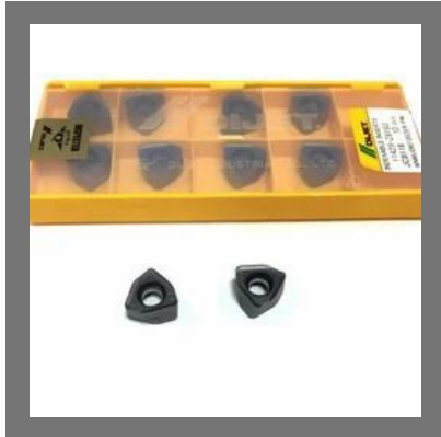
Cutting Tool Inserts