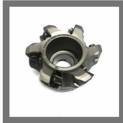
Die Cutting Tools