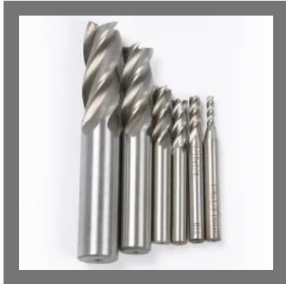
CNC Cutting Tools