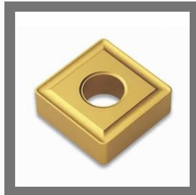
Chip Breaker Turning Inserts