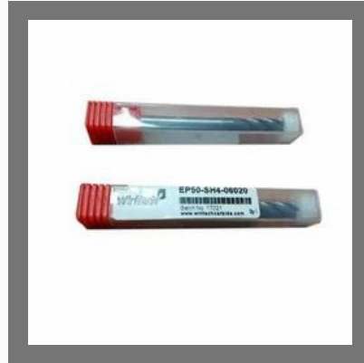
Wintech Solid Carbide Cutter