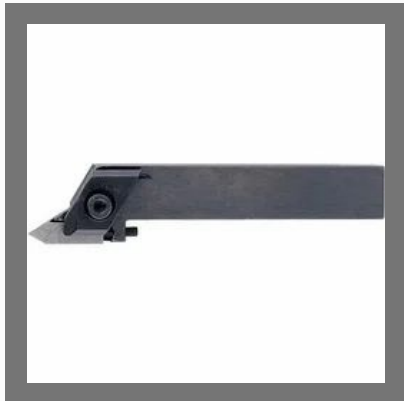
Threading Tool Holder