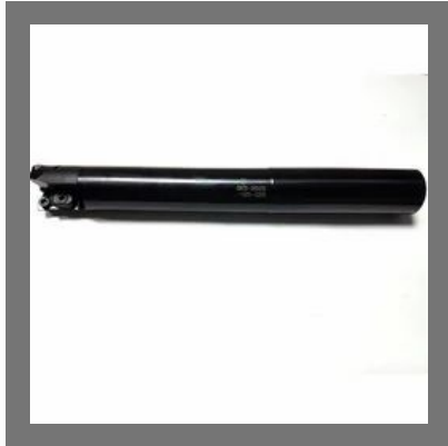
Carbide Cutting Tools