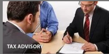
Taxation Advisory Services