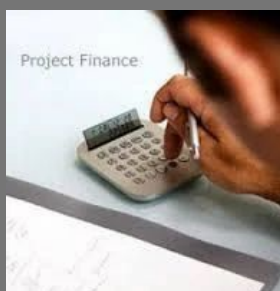
Project Financing Consultancy