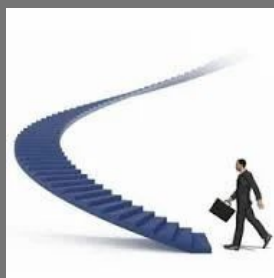
Online Company Formation Services