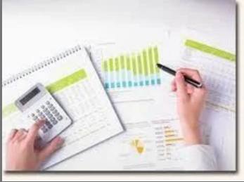
EXtensible Business Reporting Language Services