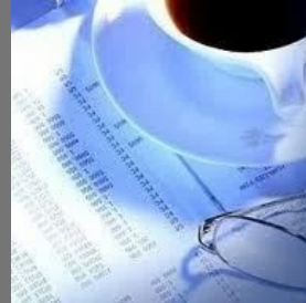
Stock Audit Assurance Services