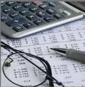
Statutory Audit Assurance Services