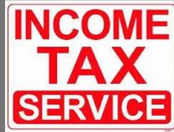
Income Tax Services