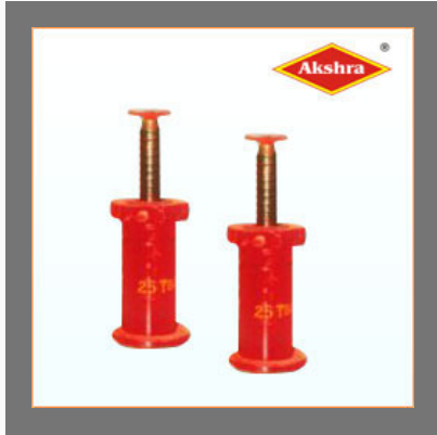
Mechanical Screw Jacks