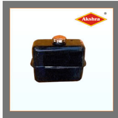
Lister Fuel Tank Small