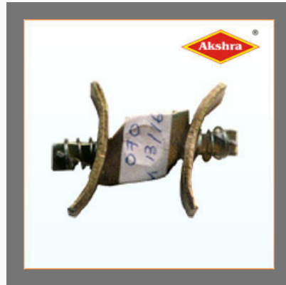
Friction Shoe Assy