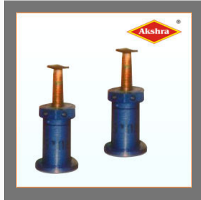
Mechanical Screw Jacks