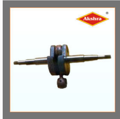
Crank Shaft With Connecting Rod