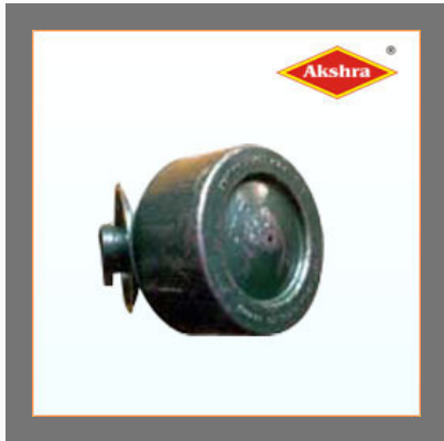
Lr Air Cleaner Housing