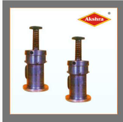
Mechanical Screw Jacks