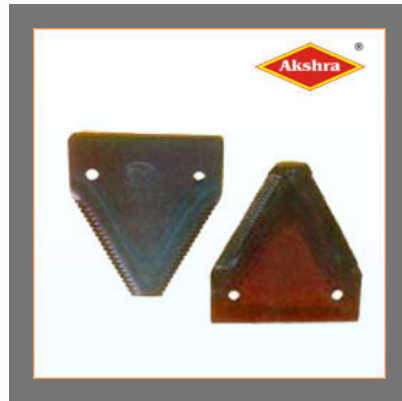
Harvestor Combine Blade