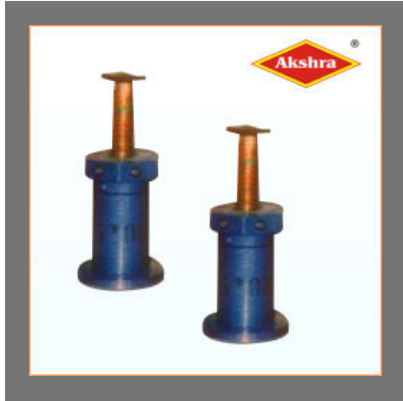
Mechanical Screw Jacks