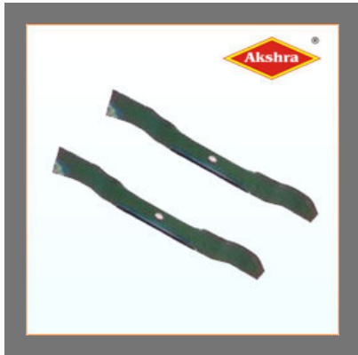
Rans Cutting Mospart Blade