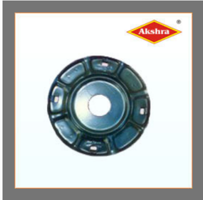
Brush Cutter Blade