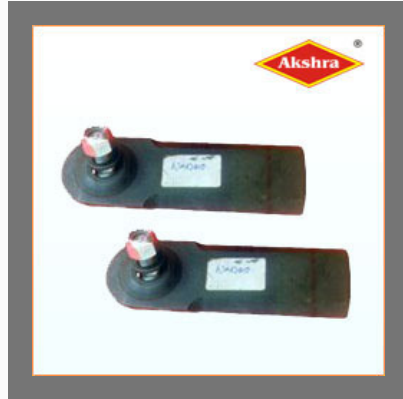
Wingmo Type Blade