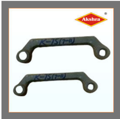
Holder Cam Plate