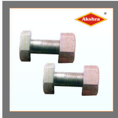
Showel Bolt & Nut & Washer