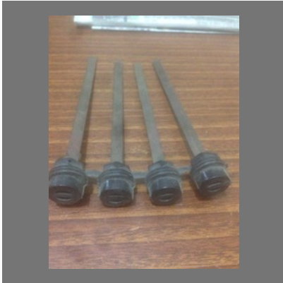
Hex Elevator Bolt