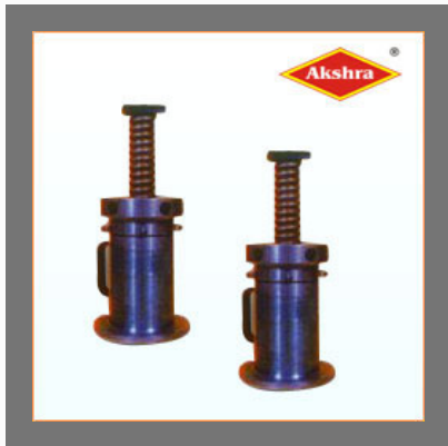
Mechanical Screw Jacks