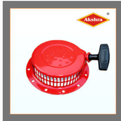
Recoil Starting Assy Honda / Greaves