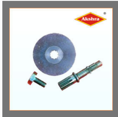
Cutter Holder Cutter Shaft