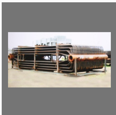
Bank Tube Assembly