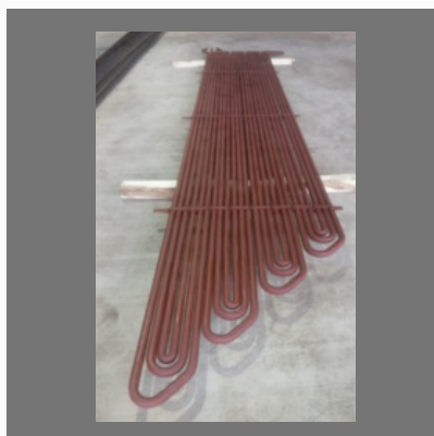
Super Heater Coil