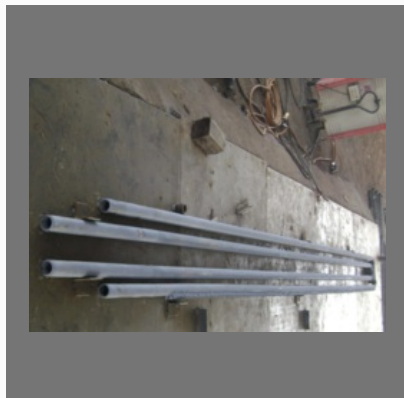
Studded Bed Evaporator Coils