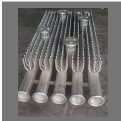
Sparger Header With Nozzles