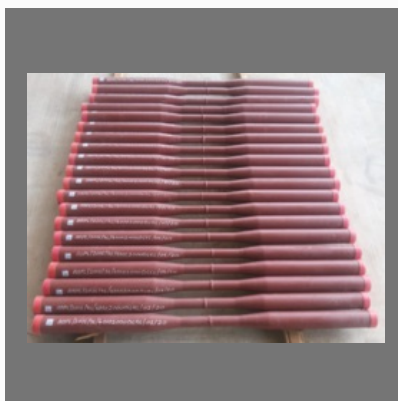
Swaged End Tubes