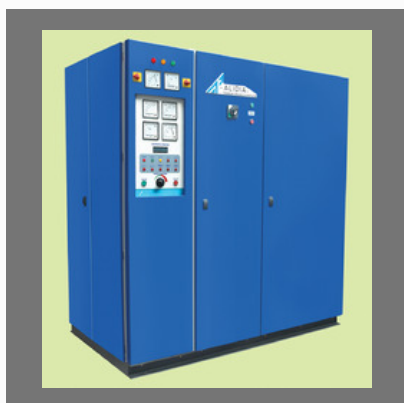
Induction Steel Melting Furnace