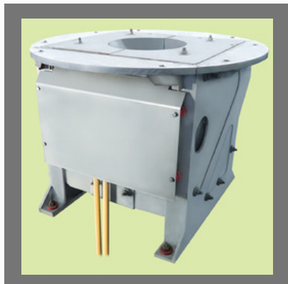
Brass Melting Furnace