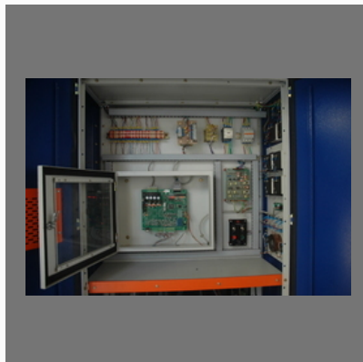
Spares For Induction Melting Furnaces