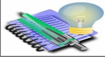
Innovation And IPR Certificate Courses