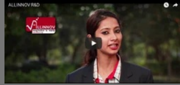
Hands On Innovation Training Services