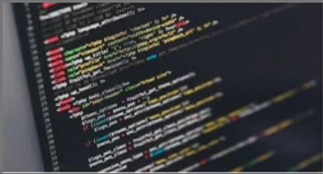
Research Assistance Program Training Services