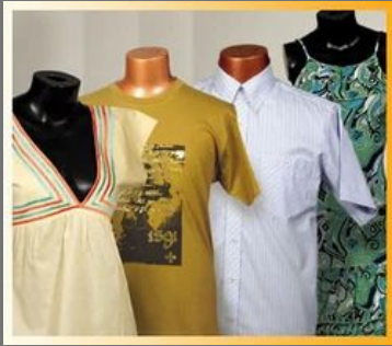
Woven And Knitted Garments