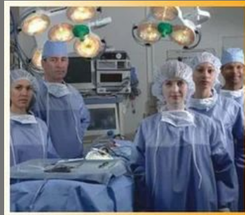
Technical Textiles Workwear Fabric