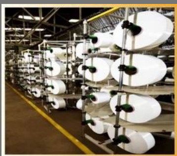
Polyester Texturised Yarn