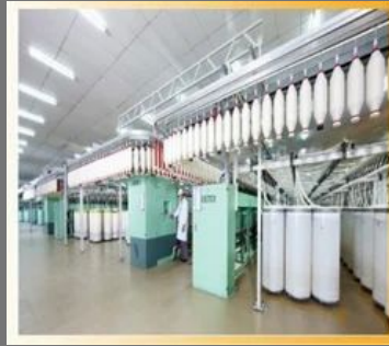
Cotton And Blended Yarn