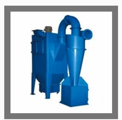
Cyclone Dust Collector