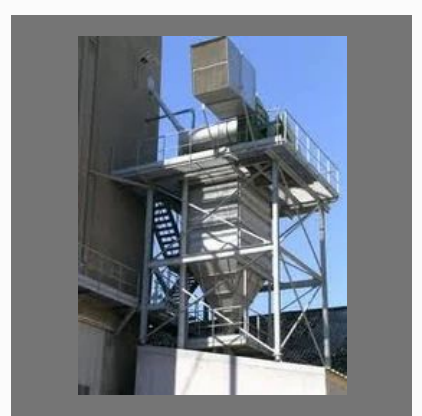
Industrial Dust Collector