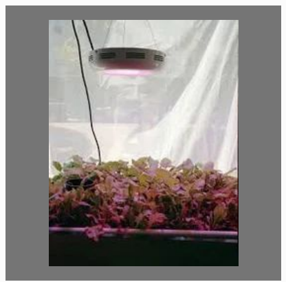
Ammonia Picking System