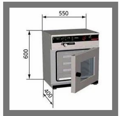
Gas Deck Oven