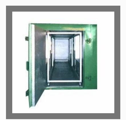
Gas Fired Dry Oven