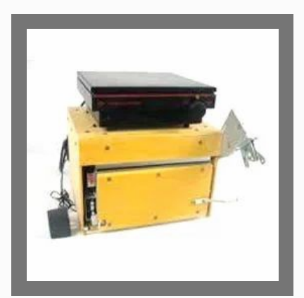
Epoxy Curing Oven