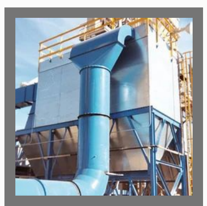
Pulse Jet Dust Collector