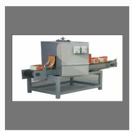
Battery Making Machine