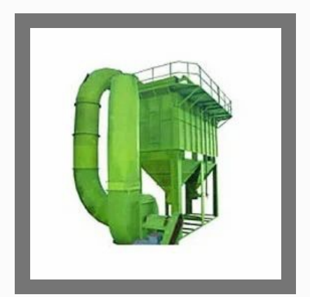
Reverse Jet Dust Collector