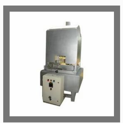
Lead Melting Pot with Automatic Panel