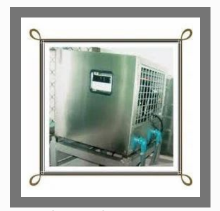
Acid Chilling System