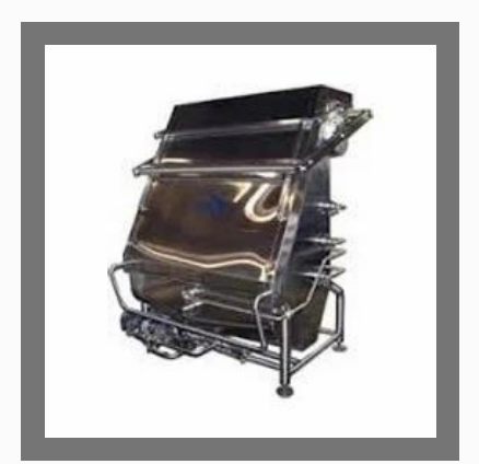
Plate Washing Tank with Wash Maximiser