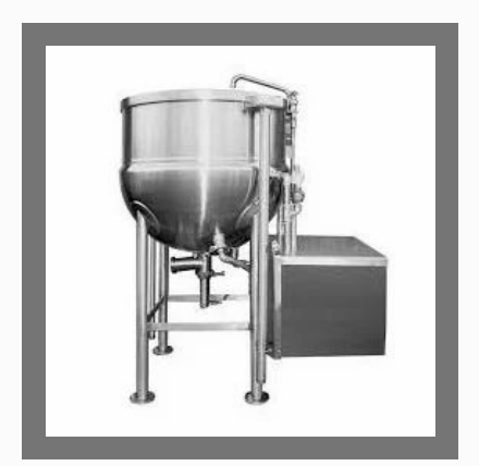
Mixer Chilling System