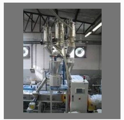
Pneumatic Conveying System