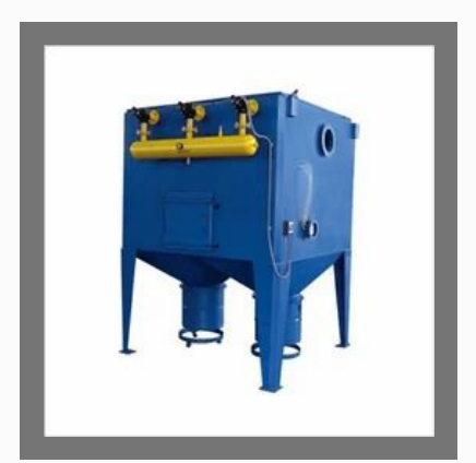
Unitary Dust Collector