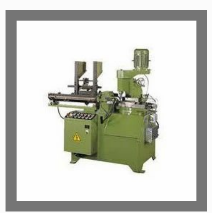
Special Purpose Machine