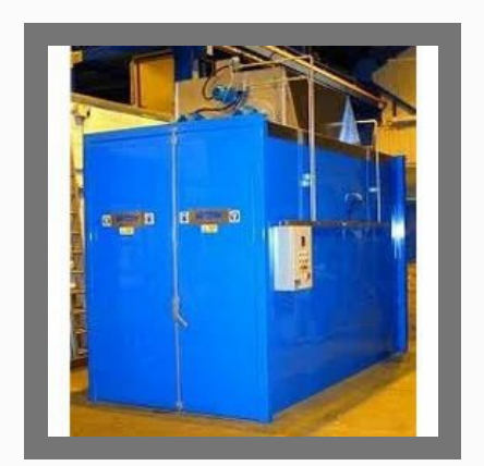
Powder Coating Oven