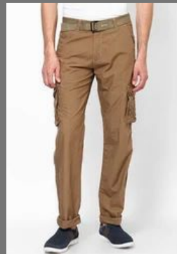
Mens Cargo Pants