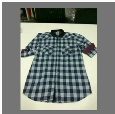
Casual Check Shirts