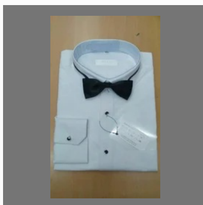
Office Wear Shirts