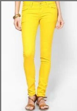
Ladies Denim Bottoms