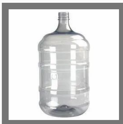
Plastic Water Jar