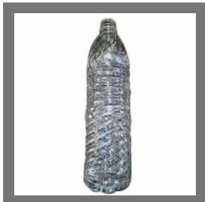
Plastic Empty Mineral Water Bottle