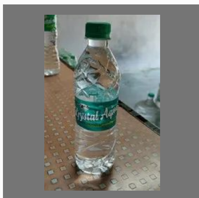
Packaged Drinking Water Bottle