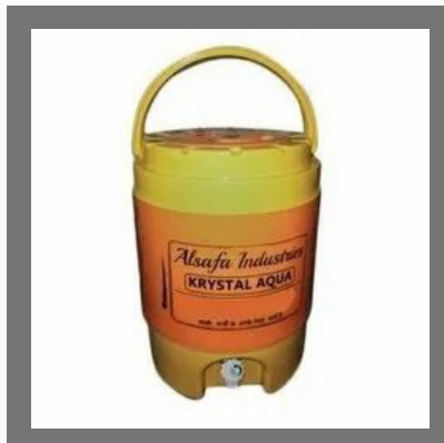
Plastic Water Camper