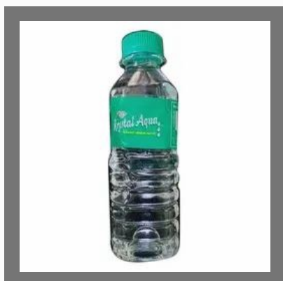
Plastic Mineral Water Bottle