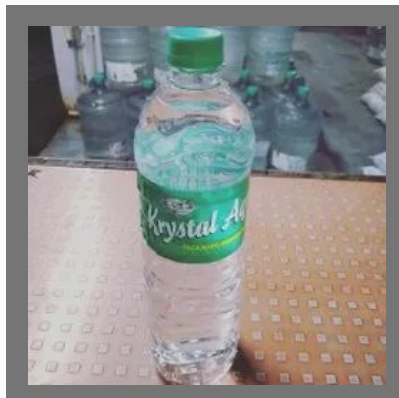
1 Liter Packaged Drinking Water Bottle