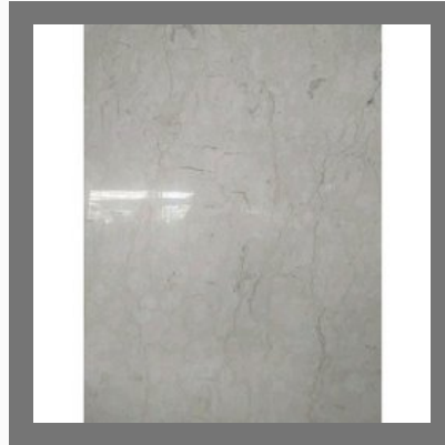
Perlato Italian Marble