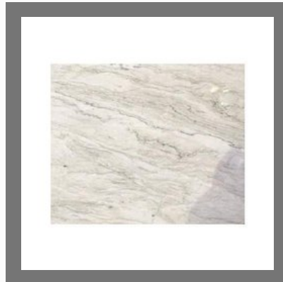
Nano Marble Stone