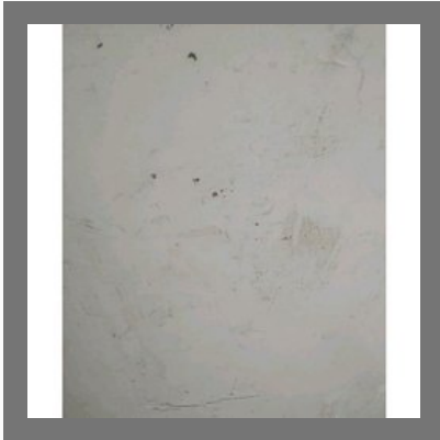
White Granite Stone