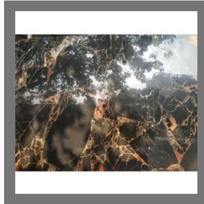
Italian Golden Portoro Marble