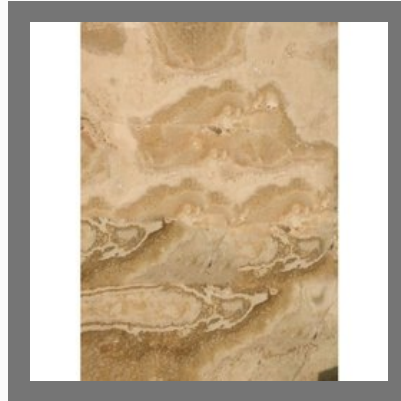
Italian Onyx Marble