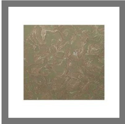
Designer Granite Slab