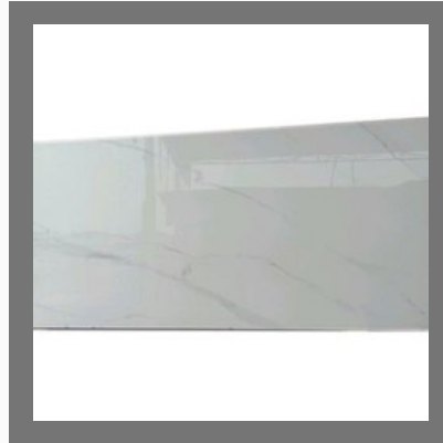
White Marble Slabs