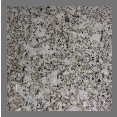
Indian Granite Stone