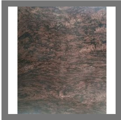
Paradiso Granite Slab