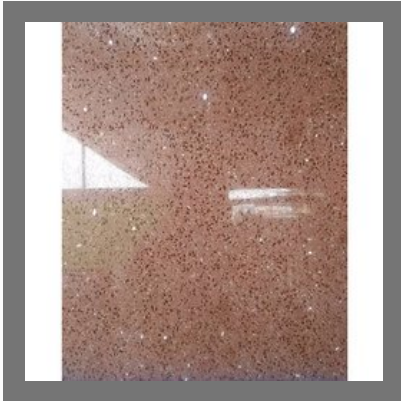
Brown Kitchen Granite Slab