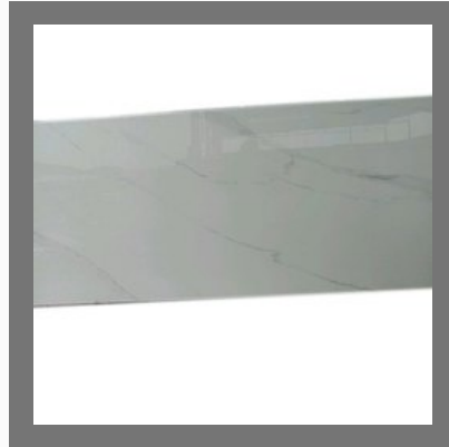
Statuario Marble Slab