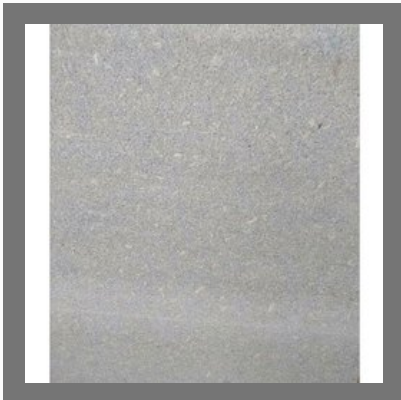
White Kitchen Marble Stone