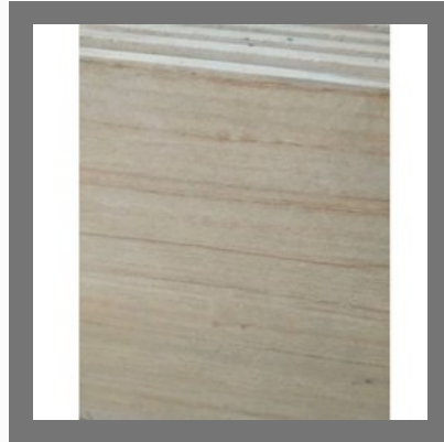
Brown Granite Slab