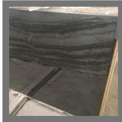
Indian Black Granite Stone