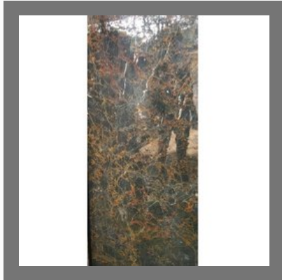
Golden Portoro Marble Slab