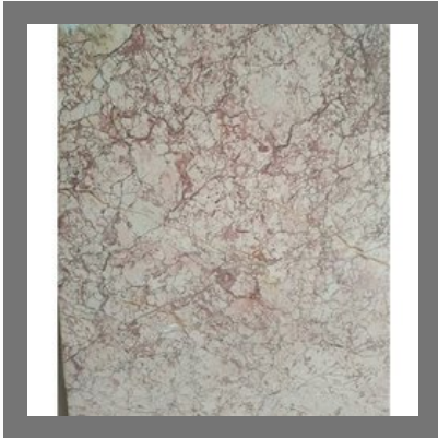
Brown Designer Marble Stone