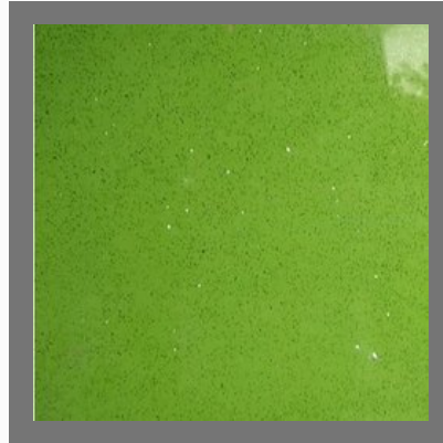
Green Granite Stone