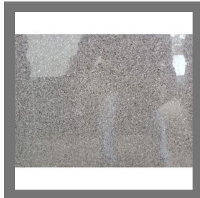
Naino Brown Marble Slab