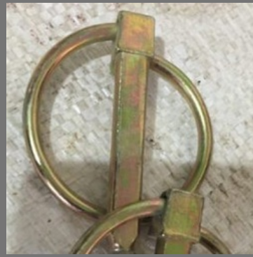
Tractor Linkage Pin