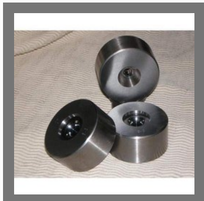
Wire Drawing Carbide Dies