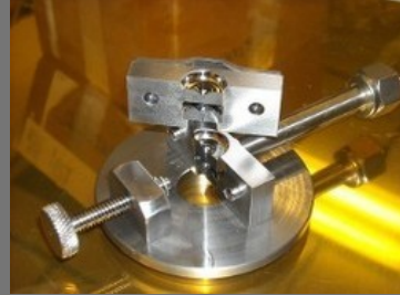
Fiber Optic Coating Metal Die