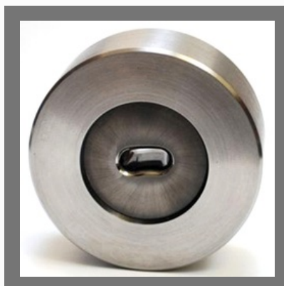
carbide shape dies