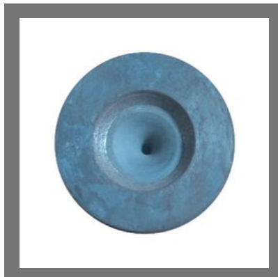
Wire Draw Dies