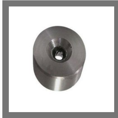
Wire draw die