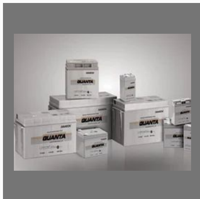
Amaron Quanta UPS Battery