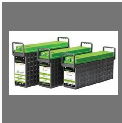
Amaron Slick Batteries