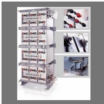
Power Stack Batteries