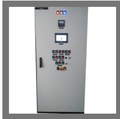
Crystal Sugar Automation Control Panel