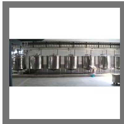
Syrup Preparation and Automation System