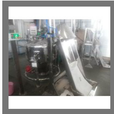
Sugar Handling and Automation System