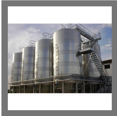
Stainless Steel Storage Tanks