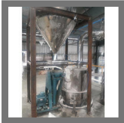
Sugar Handling Plant