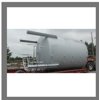
Storage Silo Tank