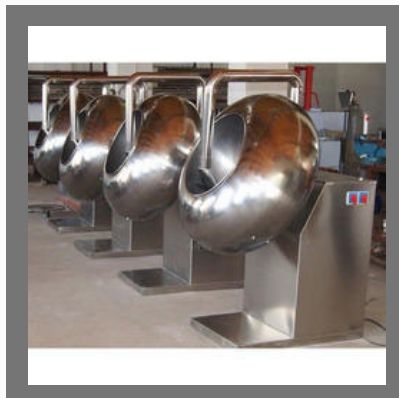
Sugar Coating Mixing Machine