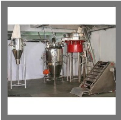
Flour Handling & Automation System