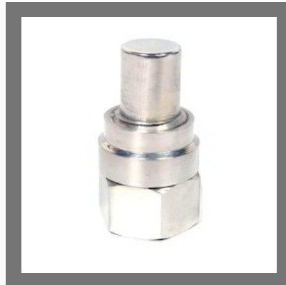
Sugar Syrup Magnet