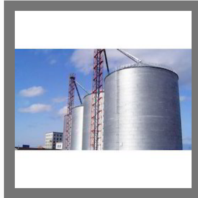
Bins Silos Storage Tanks and Weighing Systems