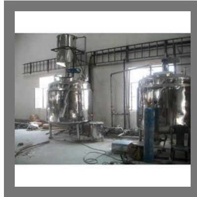
Syrup Preparation System