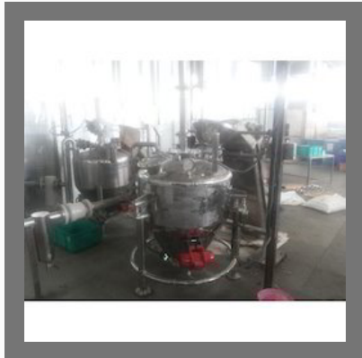
Sugar Handling Automation System