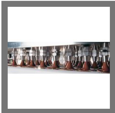
Chocolate Molding Machine