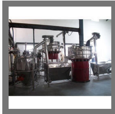
Flour Handling Automation System