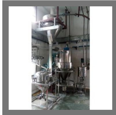
Powder Sugar Automation System