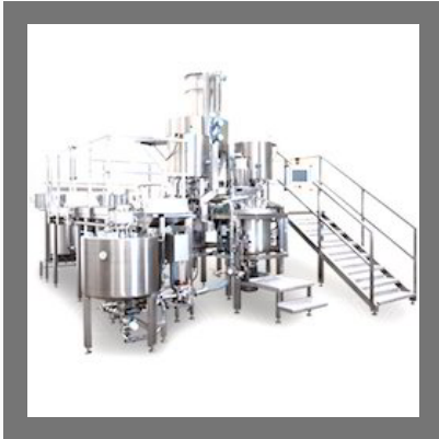
Semi Automatic Wafer Processing Plant