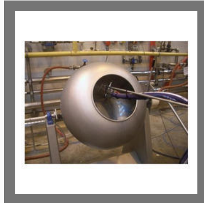
Toffee Syrup Making Machine