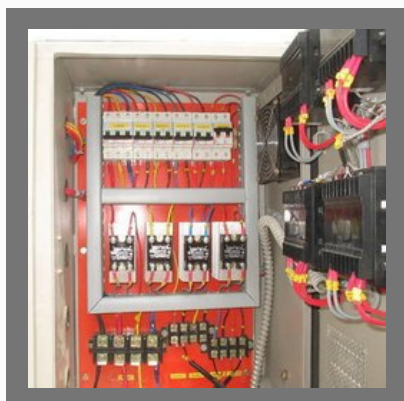
Creamer Automation Control Panel