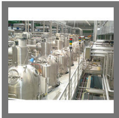
Syrup Preparation and Automation Plant