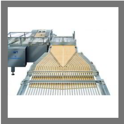
Automatic Wafer Processing Plant