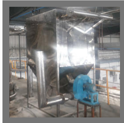
Sugar Dust Controlling System