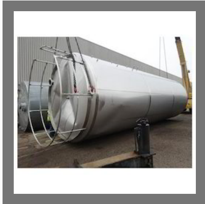
SV Storage Tank Silo