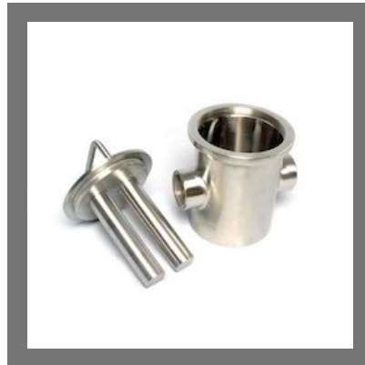
Liquid Line Magnet