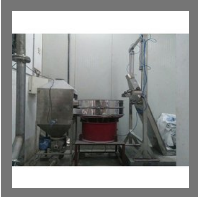
Continues Sugar Transfer System