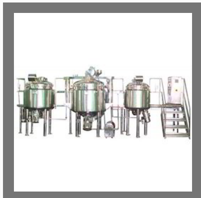
Syrup Manufacturing Plant