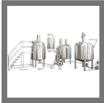
Semi Automatic Sugar Preparation System