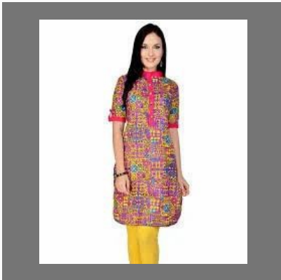
Cotton Printed Kurtis