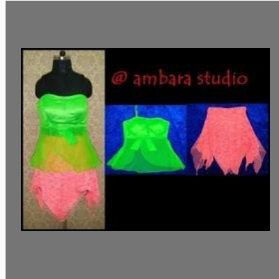
Ladies Western Wear