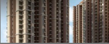
Hotel Construction Services