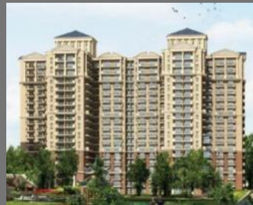
Commercial Building Construction Services