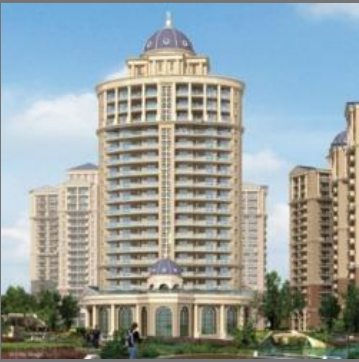
Commercial Building Construction Services