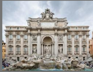
Corporate Building Construction Services