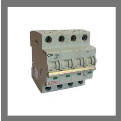
V Guard 4 Pole C20 MCB