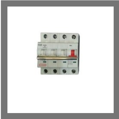
V Guard 4 Pole C63 MCB