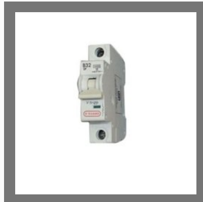
V Guard B 32Amp SP MCB