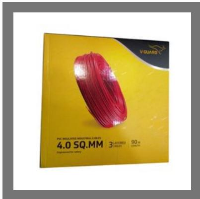
V Guard 4.0 Sqmm Electrical Wires