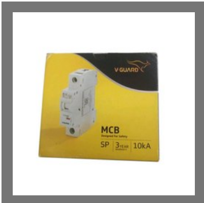
V Guard Single Pole MCB