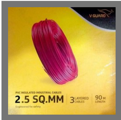
V Guard 2.5 Sqmm Electrical Wires