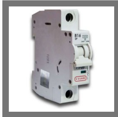
V Guard B16Amp SP MCB