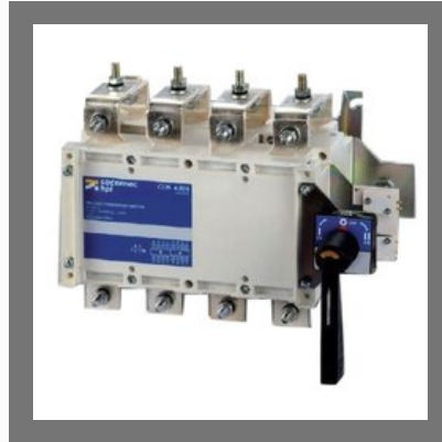
HPL Changeover Switch