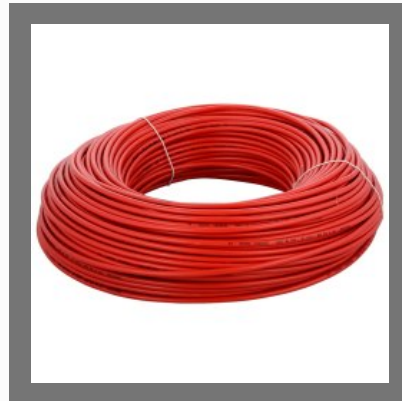
V Guard 1.5 Sqmm Electrical Wires