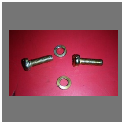
Screw And Bolts