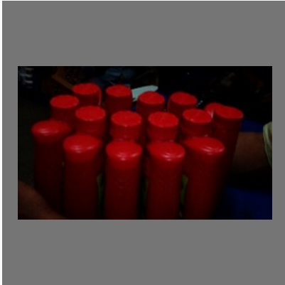
SII Purpose Oil